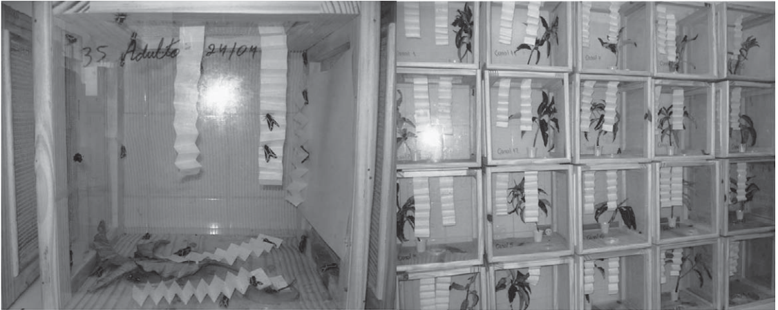
Fig. 2. Cages for oviposition of Dysschema sacrifica (Lepidoptera: Arctiidae) adults collected on Eremanthus erythropappus at Diamantina, Minas Gerais State, Brazil. This collage of images is shown online in color in supplementary material for this article in Florida Entomologist 97(3) (2014) at http://purl.fcla.edu/fcla/entomologist/browse .

laboratory, thus the species biology could not be assessed.