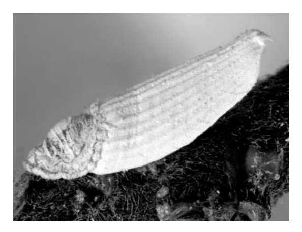
Fig. 1. Crypticerya genistae