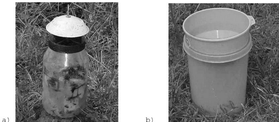
Fig. 1. Traps used for capturing the tuberoses black weevil S. acupunctatus : a) Victor trap, and b) Funnel trap.

Fieldwork was conducted from August to October, 2001, in Morelos, México (18°53'N-99°11'W) at an altitude of 1350 m. A 1.2-ha parcel planted with offshoots of P. tuberosa was used as an experimental field and was divided into 18 plots (28 × 35m), with one trap placed in the center of each plot. A two-factor design (two trap types and two bait types) including six treatments and three replicates was used. The traps evaluated were the Victor (V) trap made of transparent plastic measuring 9 × 16 × 7 cm (depth:height:width) with a black cap having four 1 cm-diameter orifices at its base and with a yellow umbrella-shaped cap measuring 7 cm in diameter (Fig. 1a) and a yellow