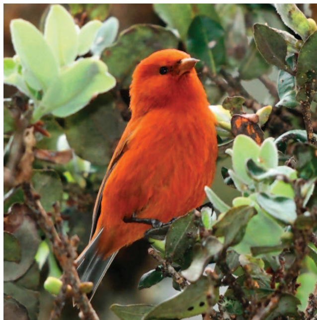
FIGURE 1. Male Hawai'i 'Ākepa ( Loxops coccineus coccineus ). These endangered Hawaiian honeycreepers are 1 of only 18 extant species from more than 50 Drepanidinae that evolved in the Hawaiian Islands. This specialist insectivore is found only in montane old-growth forest on the island of Hawai'i and uses its crossed bill to open leaf buds and expose the insects, primarily microleps and spiders, on which it feeds.

We used the standard statistical procedure of log-transforming population densities to control error variance (Neter et al. 1996). Although residual plots are useful for assessing whether the variance of the error terms is constant, their interpretation is somewhat subjective, and concluding definitively between residuals expressing a pattern or providing an adequate fit can be difficult. This is especially true of our time series with fewer than 30 points. Therefore, we used the modified Levene test to provide a