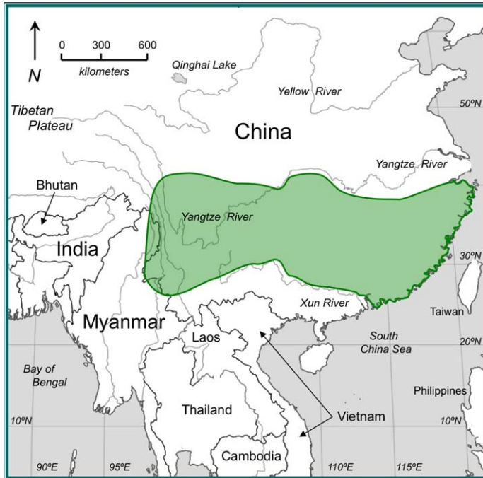
Fig. 2. —Distribution of Elaphodus cephalophus in a large area of southern China from the eastern reaches of the Tibetan Plateau to the southwestern coastal mountains and northwestern Myanmar; occurrence in Myanmar is based on historical records because no recent observations of E. cephalophus have been made there (base map from Brigham Young University's Geography Department, https://geography.byu.edu/pages/resources/outlineMaps.aspx ).