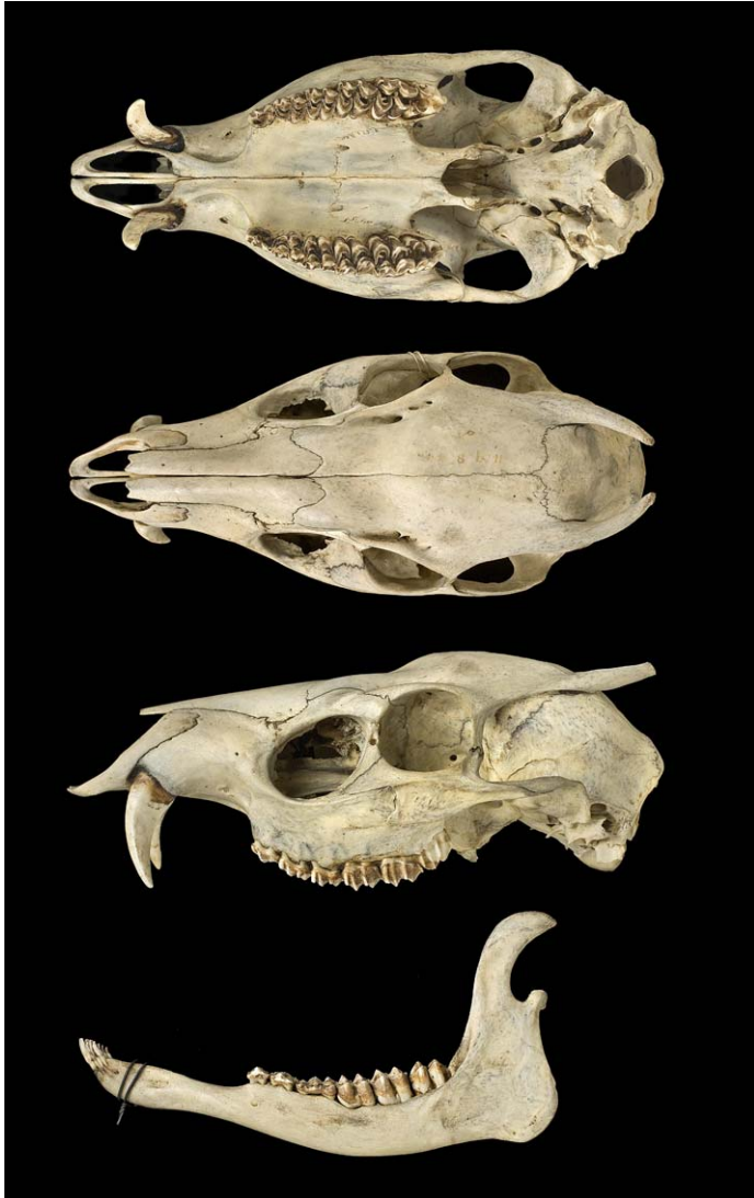
Fig. 3. —Ventral, dorsal, and lateral views of skull and lateral view of mandible of an adult male Elaphodus cephalophus (The Natural History Museum, London, specimen 11.9.8.44); upper canines, particularly large preorbital openings, and reduced and convergent antler pedicels (on males only) are characteristic. Greatest length of skull is 196.0 mm.