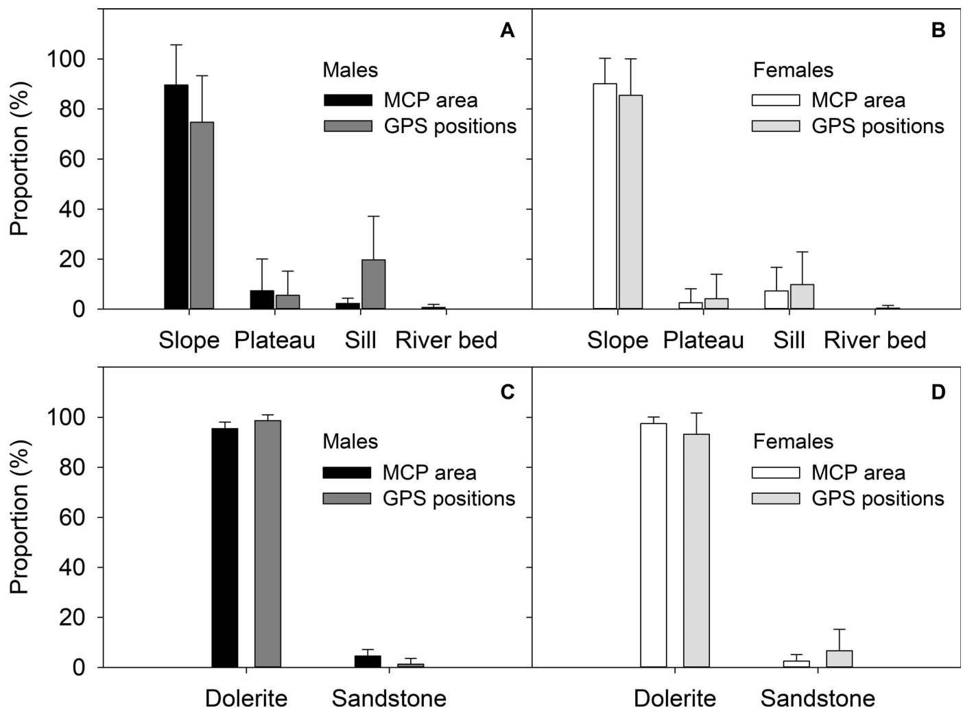
Fig. 3. Mean proportions and standard deviations of home ranges (minimum convex polygons, MCP), and of GPS positions, representing specific microhabitats (A–B) or rock types (C–D), for three male (A and C) and seven female (B and D) Karoo Dwarf Tortoises ( Chersobius boulengeri ) in 2018–2020.

MDMDs are a coarse proxy of actual movement distances (Iglay et al., 2006). Despite inherent underestimation of actual movement distances, MDMDs can provide insight into how tortoises use their home ranges (Lagarde et al., 2003; Rozyłowicz and Popescu, 2013), and even provide insight into conservation statuses of populations (Guyer et al., 2012). Male and female Karoo Dwarf Tortoises had similar MDMDs, which were near ranges of MDMDs in other tortoises (Geffen and Mendelsohn, 1988; Franks et al., 2011; Rozyłowicz and Popescu, 2013). MDMDs in Karoo Dwarf Tortoises may reflect distances among suitable retreats (i.e., most GPS positions were for hiding tortoises; Loehr et al., 2021), but the distribution of retreats was not recorded in the current study. Although recordings were made during the summer mating season, males did not seem to travel greater distances than females to find mates, as has been found in other tortoise species (Lagarde et al., 2003; Hofmeyr et al., 2012). Despite similar MDMDs in male and female Karoo Dwarf Tortoises, associated predation risks may be larger for males that represent the smaller sex, because avian predation appeared to be targeted at smaller individuals (Loehr and Keswick, 2022).