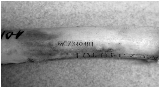
FIG. 2. Great Currawong ( Crax nigra ) MCZ 340401. Coracoid shaft marked by laser engraving. Note the traditional pen and ink numbering "401" that was applied over 100 years ago. The engraving "MCZ340401" is 8.5 mm long.

Of the two main impediments in preparation of osteological specimens, element-numbering seems the most tractable for improvement. Several new technological developments offer promising alternatives to numbering each element by hand with pen and ink. Precision laser engraving can be quite quick, about 1 s per element, using numbers, letters, symbols, even