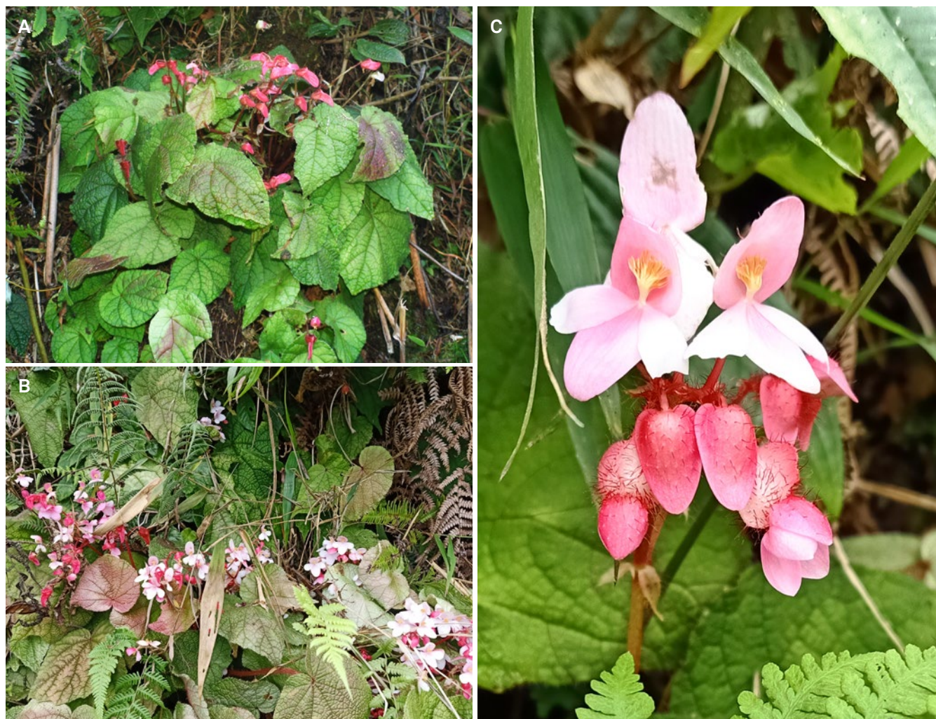
Fig. 2. – Begonia egamii D. Borah, Taram & M. Hughes. A, B. Habitat; C. Detail of staminate flowers showing the unusual asymmetric androecium.

Flowers from November to December, fruiting from December to January.