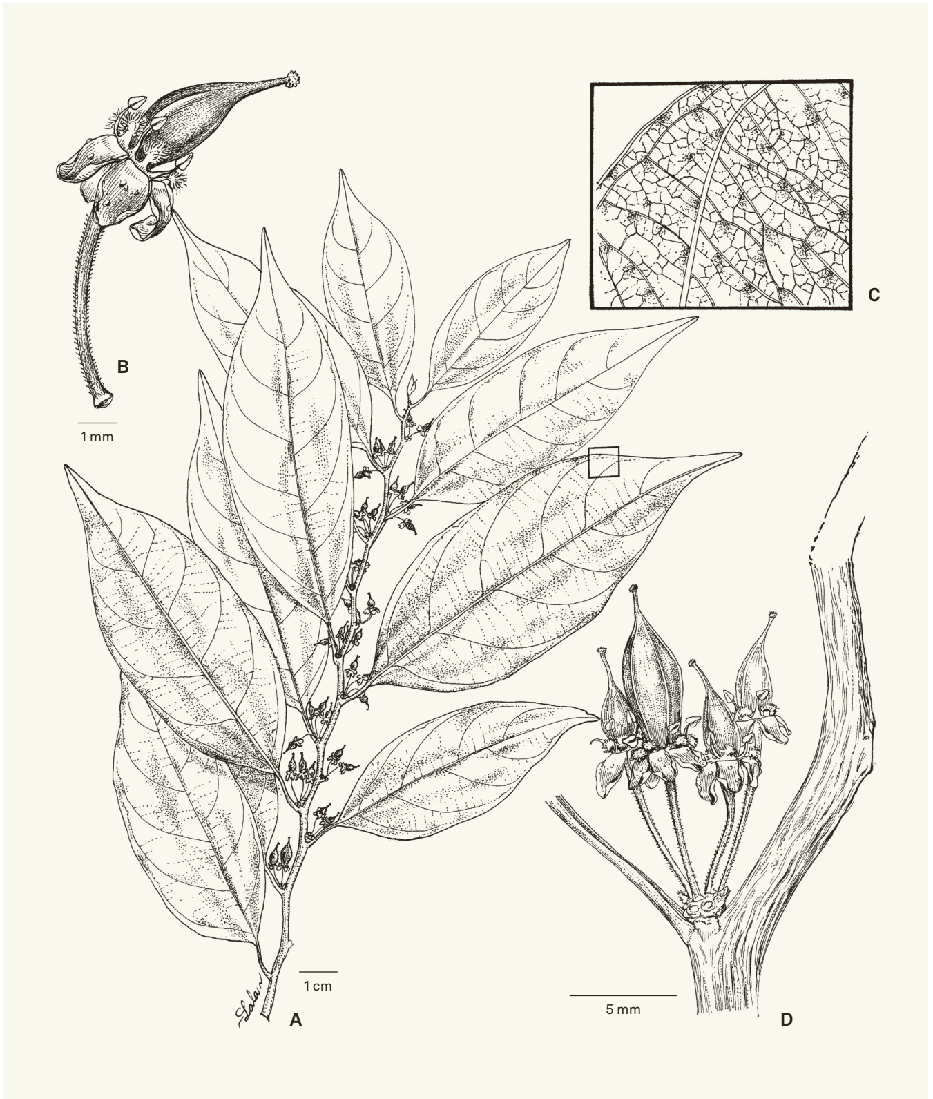
Fig. 1. – Casearia razakamalalae Philpott & Appleq. A. Flowering branch; B. Flower post-anthesis in early fruit development; C. Detail of abaxial leaf surface with conspicuous reticulated higher-order venation; D. Inflorescence. [Razakamalala et al. 5006, TAN] [Drawings: R.L. Andriamiarisoa]