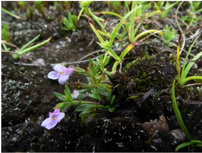
Fig. 2. – Linderniella porembskii Andriamiar. & Rabarim. [ Rabarimanarivo et al. 741]

some that advocate for urgent protection of this neglected habitat (POREMSKI et al., 2016). He also participated in the collection of the type in 2016.