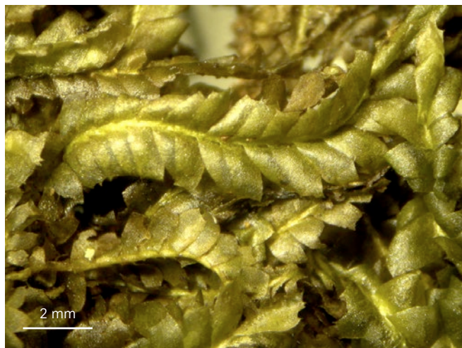
Fig. 1. – Chiloscyphus parapilistipulus Thouvenot: habit, dorsal view. [Thouvenot NC2451]

distal angles, to shallowly bifid, lobes short, widely triangular, minutely apiculate, some leaves with rounded apices. Leaf cells hexagonal, isodiametric to slightly elongate, 44–66 \mu\text{m} long, 25–52 \mu\text{m} wide, walls thin without trigone. Underleaves small, not or hardly wider than the stem, overall oval, deeply bifid, disc wider than long, 3–4 cells high, insertion line semi-circular, lateral margins with a small obtuse tooth on both sides, teeth sometimes linear, lobes erect or crescent shaped, narrowly lanceolate acuminate to linear, sinus lunate. Sexual condition dioicous. Gynoecia (unfertilized), terminal on very short intercalary ventro-lateral branches without vegetative leaves or underleaves, bracts oval, 1.2–1.8 mm long, bifid, lobes ovate acute, a lanceolate segment usually developed on the upper part of a single lateral margin otherwise entire or with rare small teeth, bracteole deeply bifid, 1.5 mm long, lobes narrowly lanceolate, more or less convergent, margins entire, perianth 2–2.5 mm long, cyathiform, smooth, mouth tri-lobate, lobes deeply laciniate. Androecia not seen.