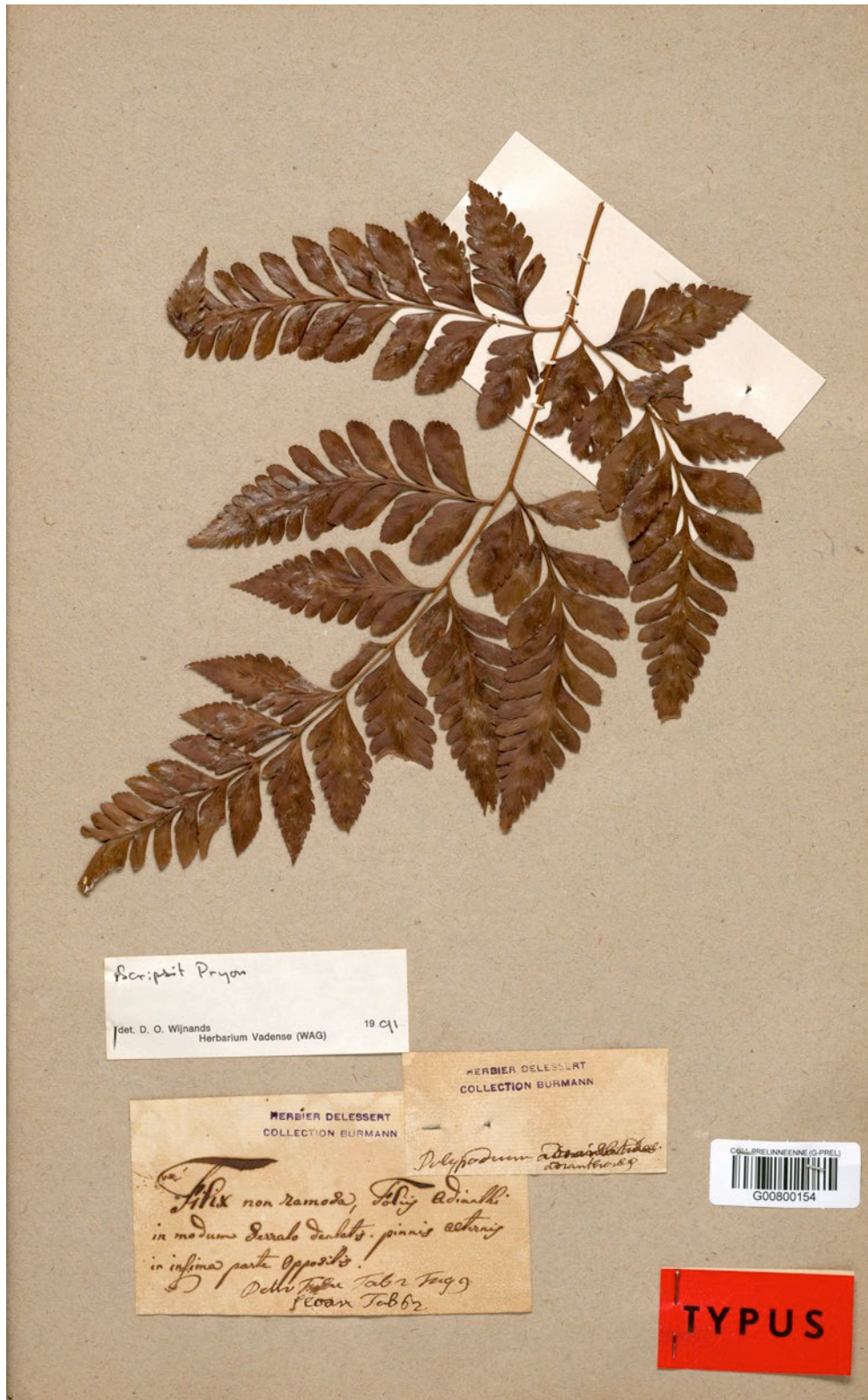
Fig. 4. – Lectotype of Polypodium adiantoides Burm. f. in G-PREL.