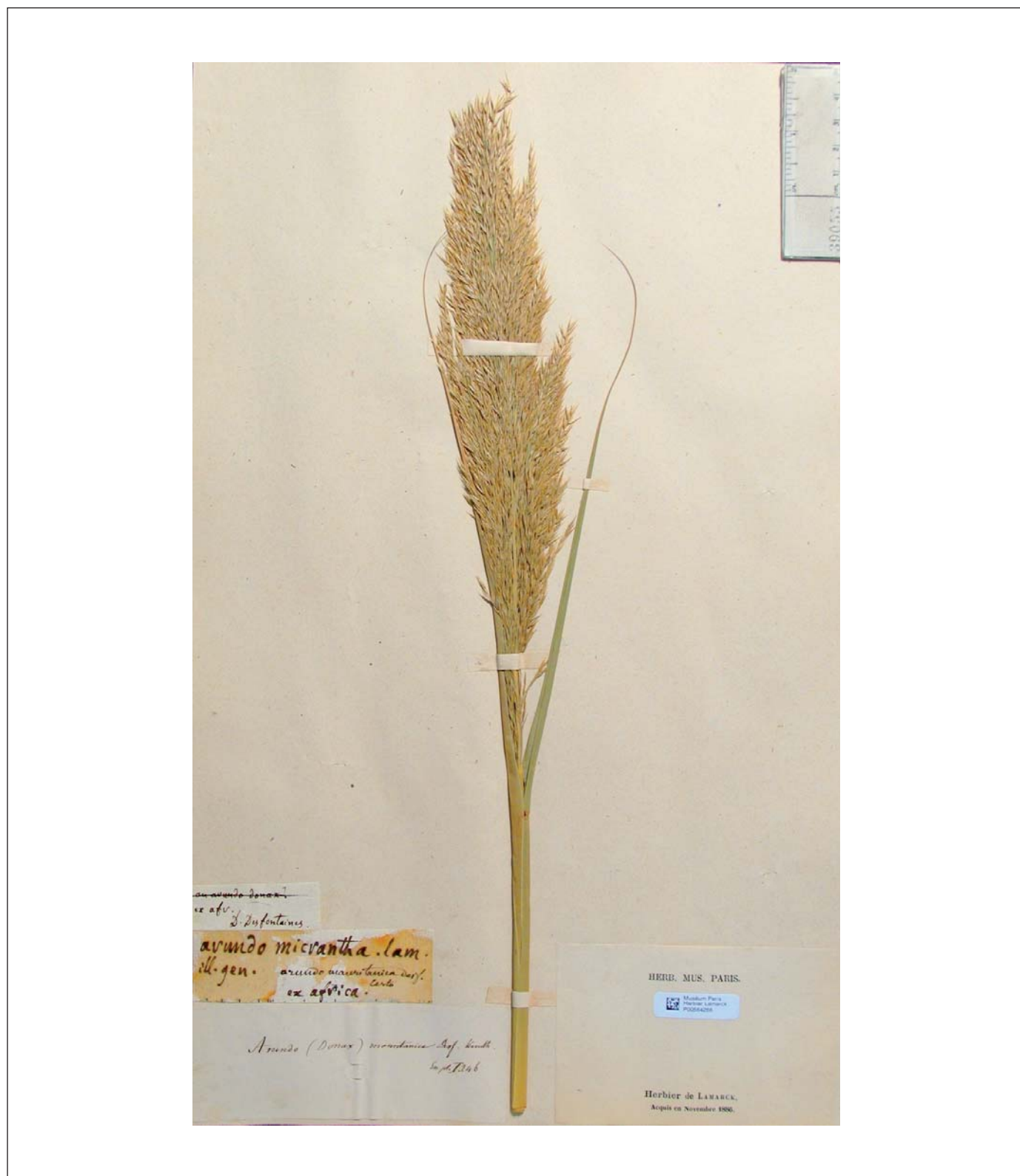
Fig. 1. – Holotypus of Arundo micrantha Lam.

[Desfontaines s.n., P-LA]