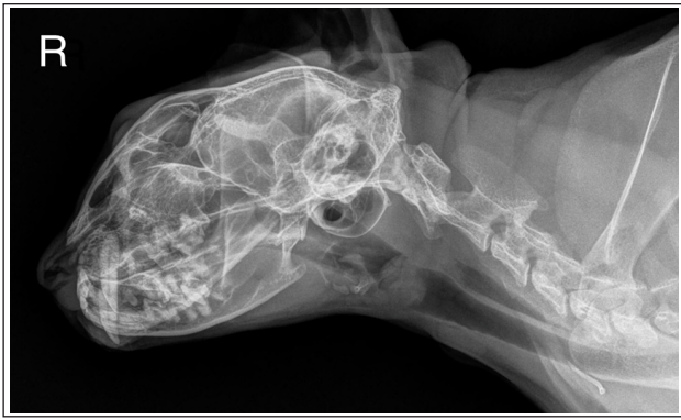
Figure 1 A round, homogeneously soft tissue opaque structure (ie, laryngeal cyst) was appreciated within the larynx on a right lateral radiograph of the head and neck region of the patient.

radiologist, with the pertinent finding of a homogeneously soft tissue opaque structure within the larynx, caudal to the epiglottis, which exhibited rounded cranial and caudal margins (Figure 1). The cat was referred for additional diagnostics and treatment.