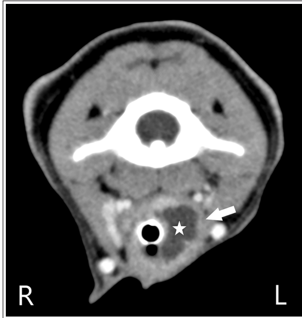
Figure 4 Post-contrast transverse CT image displayed on a soft tissue window width/window level at the level of the first cervical vertebra. A thin-walled, centrally fluid-attenuating structure (marked with a white star) is seen within the left aspect of the larynx. The structure has a thin, contrast-enhancing peripheral rim (white arrow) and occupies more than 50% of the laryngeal lumen

sterile cotton bud. The oral cavity and laryngeal region then appeared normal. The cat was given 0.2mg/kg butorphanol (Torbugesic; Zoetis) and 0.15mg/kg dexamethasone sodium phosphate (Dexamethasone Sodium Phosphate Injection; Vedco) IV to aid recovery and extubated without issue. The patient recovered uneventfully and was discharged the following day. The fluid was submitted for cytological examination, which revealed basophilic mucinous material (consistent with inspissated saliva), mild granulomatous inflammation with evidence of chronic hemorrhage and mild squamous epithelial atypia, which was suspected to be associated with inflammation.