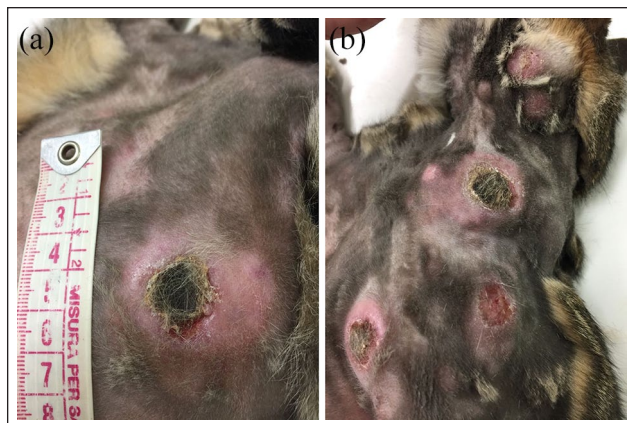
Figure 1 (a) A single nodular lesion, 3 cm in diameter, localised on the medial surface of the left thigh, presenting with a scab on the top. (b) Round, nodular lesions, localised in the region of the thorax and abdomen. The cat was first subjected to hair removal, which highlighted the hyperaemic aspect of skin

Nearly a month after the skin nodule eruption, the cat was presented for clinical evaluation and pharmacological treatment. Corticosteroids improved the patient's