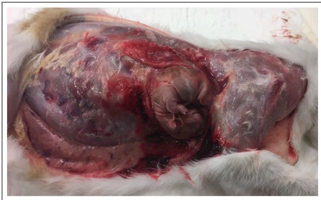
Figure 2 Post-mortem photograph of the right lateral thoracic and abdominal wall with the skin removed as part of the necropsy examination of a female domestic shorthair cat, euthanized after having been hit by a car. Dissection of thoracic subcutaneous tissues revealed a herniated fetus, ecchymosis and mild hemorrhage

Necropsy was initiated by extending a small, full-thickness cutaneous laceration on the right lateral thoracic wall. The first fetus was immediately present in the subcutaneous space over right ventrolateral thorax (Figure 2). Dissection was continued cranially through the subcutaneous tissues along the lateral aspect of the thorax to expose a second extraluminal fetus, the head of which was entrapped in the brachial plexus. The abdominal musculature was avulsed at its insertion on the ribs with partial herniation of small intestines. Within the peritoneal cavity, the right uterine horn was torn in half