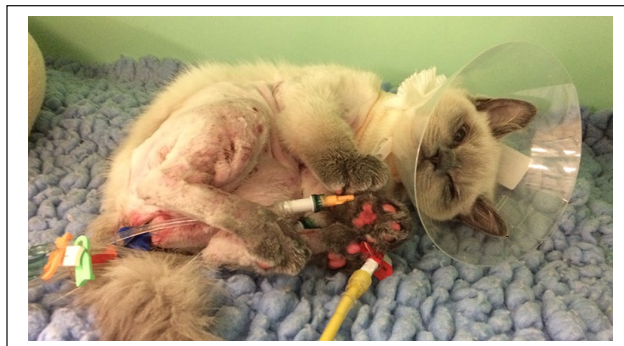
Figure 2 Enteral nutrition was administered by constant rate infusion via the oesophageal feeding tube

On day 3, the kitten started to eat small quantities of kitten food (Hill's Science Plan Kitten) when offered by hand. The calories ingested voluntarily were minimal and O-tube feeding continued at 100% of the calculated RER. Neutropenia resolved on day 4 (Table 1); however, the pyrexia persisted, with the rectal temperature fluctuating between 39.3°C and 40.5°C. In the absence of documented