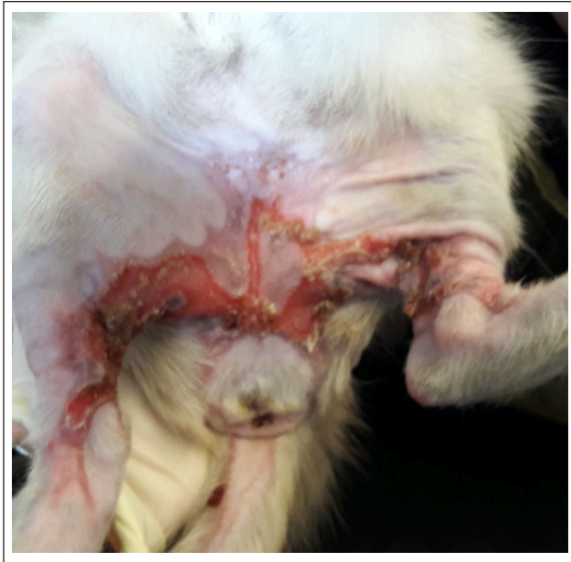
Figure 5 Incomplete healing of skin lesions 5 days after discharge from the hospital

Plan Kitten) and increase the amount of food offered if there was a decrease in body weight. Body weight was 1.4 kg vs 1.53 kg on admission. BCS was 3/9 vs 4/9 on admission and the muscle condition score had decreased from 2/3 to 1/3.