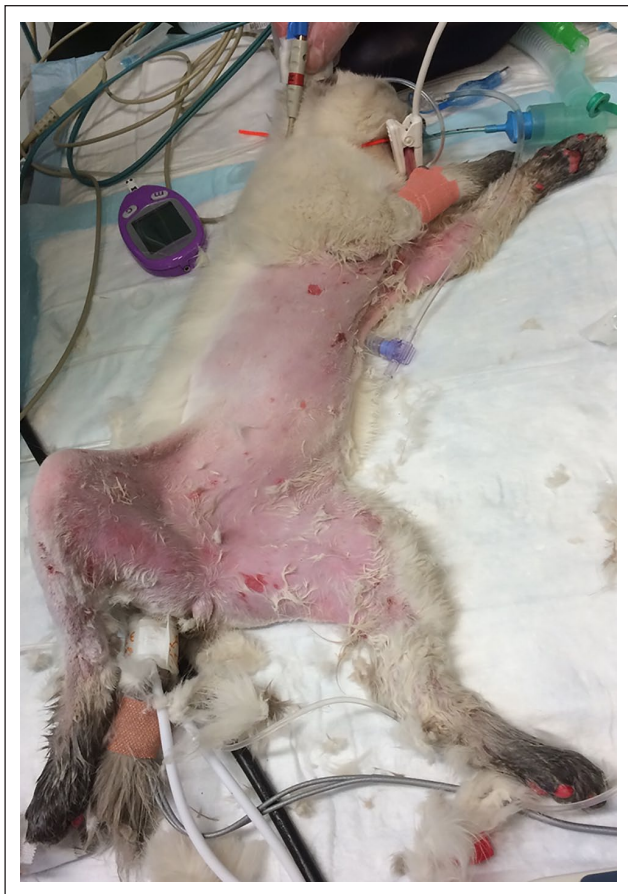
Figure 1 Clipping of the haircoat following admission revealing scalding and erythema of the ventral thorax, abdomen, thoracic/pelvic limbs and perineum with areas of ulceration

Haematology and biochemistry panels sampled on admission revealed a non-regenerative mild anaemia, neutropenia, hypoalbuminaemia, hypocholesterolaemia and increased alanine aminotransferase (ALT) activity (Table 1). On day 2, the kitten remained pyrexial at 39.9°C. The urinary catheter was removed and the central venous catheter was replaced as it had been removed by the patient. Pyrexia persisted despite new vascular access. No erythema or discharge of the O-tube site was detected on daily assessment. Urinalysis indicated no evidence of urinary tract infection and urine culture demonstrated no microbial growth. IV potentiated amoxicillin 20mg/kg q8h (Augmentin; GlaxoSmithKline) was initiated on day 3.