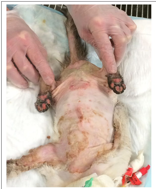
Figure 3 Progression of the deep partial thickness (second degree) burns on day 4 of hospitalisation

underlying structural disease or changes consistent with endocarditis. The murmur was deemed to be haemic secondary to anaemia (Table 1). Cardiac troponin I was mildly increased (0.4 ng/ml; RI <0.04). The mild increase in cardiac troponin I concentration was attributed to myocardial injury related to systemic inflammation.