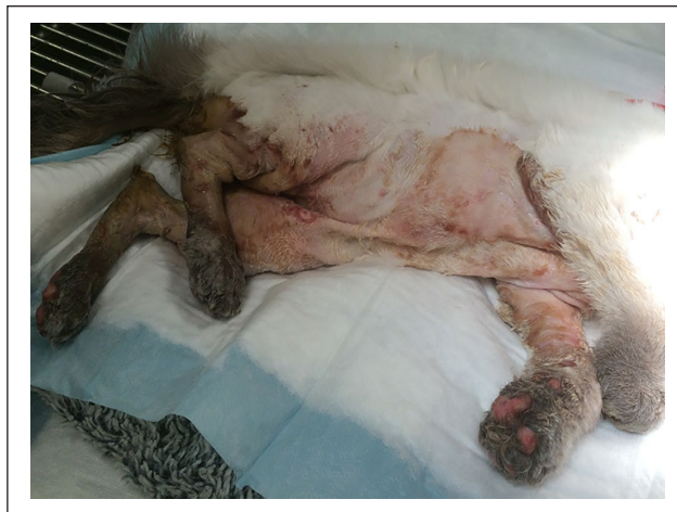
Figure 4 Necrosis of skin lesions prior to debridement on day 8 of hospitalisation

Dyspnoea developed on day 15 of hospitalisation and the kitten was placed in an oxygen kennel set at 60% fraction of inspired O 2 . Thoracic radiographs identified cardiomegaly without infiltrative pulmonary disease. Point-of-care ultrasound identified diffuse pulmonary B lines on day 16 of hospitalisation. Pulmonary B lines are associated with peripheral interstitial–alveolar disease of varying aetiology. 13 Acute respiratory distress syndrome was suspected, although thromboembolism or aspiration pneumonia could not be excluded. The respiratory signs resolved within 7 days of occurring and oxygen therapy was de-escalated.