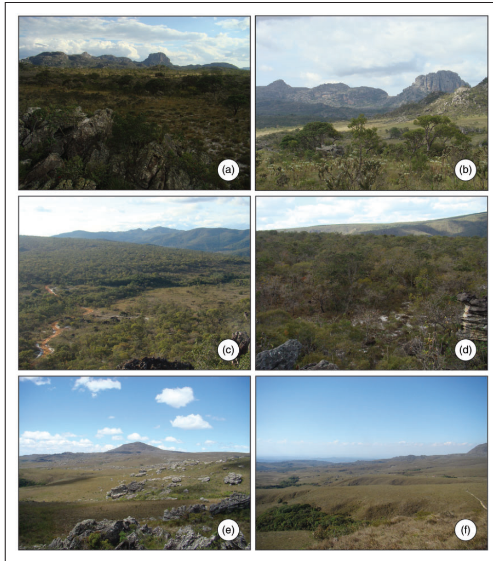
Figure 2. Habitats in the Diamantina Plateau. (a and b) Sempre Vivas National Park, RAPELD module area PNSV I with campos rupestres and cerrado savannas; (c and d) Rio Preto State Park, RAPELD module area PERP I with campos rupestres, cerrado savannas, and transitional areas; (e and f) Rio Preto State Park, RAPELD module area PERP II with campos rupestres and gallery forests.

surrogate of functional diversity, a highly informative biodiversity metric (Gallardo, Gascón, Quintana, & Comín, 2011). Asteraceae genera have been used to evaluate the efficiency of the conservation unit network in Mexico (Villaseñor, Ibarra, & Ocaña, 1998).