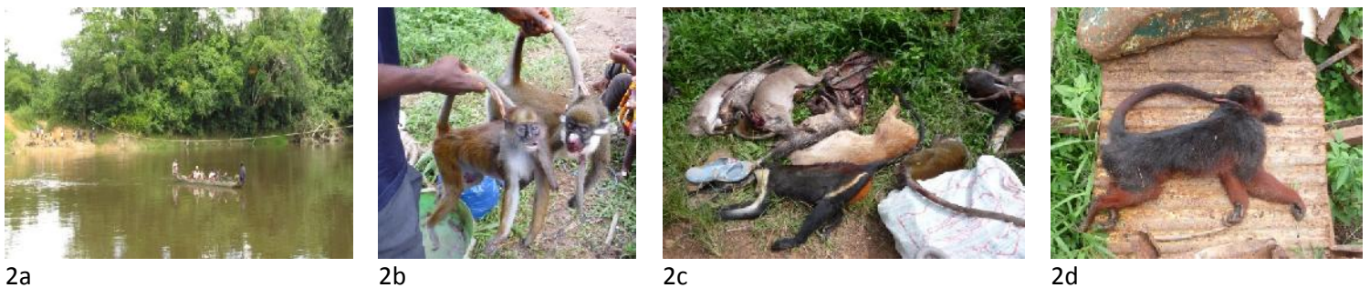
Fig. 2. Images from the Daobly bushmeat market. 2a: Canoe traveling across the Cavally river to the market. Canoes ferry sellers and their bushmeat from Liberia to Ivory Coast. 2b: Olive colobus (left) and Lesser spot-nosed monkey (right) for sale at the Daobly Market. 2c: Collection of animals for sale including duikers, porcupines, Diana monkey, Lesser spot-nosed monkey, and a collection of dried primate and duiker carcasses. 2d: Western red colobus for sale at the market.

During eight visits to the market, we counted 723 animals including 264 primates (Table 2; Figures 2b, 2c, 2d show scenes from the market). Duikers and forest antelope constitute 57% of all meat traded. Of the 264 primates sold, 68% were smoked (i.e., preserved by drying over fire). The most common primate was the Lesser spot-nosed monkey ( Cercopithecus petaurista ) [25%] followed by the Diana monkey ( Cercopithecus diana ) [19.3%]. The least observed primate was the Putty-nosed monkey ( Cercopithecus nictitans ), consisting of a single specimen. The three colobines – Western red colobus ( Procolobus badius ), Olive colobus ( P. verus ), and King colobus ( Colobus polykomos ) – were encountered in similar frequencies, 9.5%, 10.6%, 11.4%, respectively. Two chimpanzees, one freshly killed and one smoked, were encountered and no prosimians were observed during our visits.