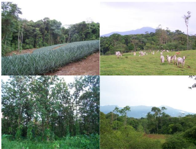
Fig. 2. Four representative matrix land-use types within the San Juan – La Selva Biological Corridor. From left to right: pineapple plantation, cattle ranch, tree plantation, eco-lodge reserve.