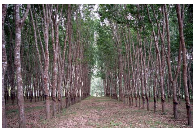
Fig. 4. Left: Village of Dai with rubber plantation behind. Right: Rubber plantation. Southern Yunnan, China