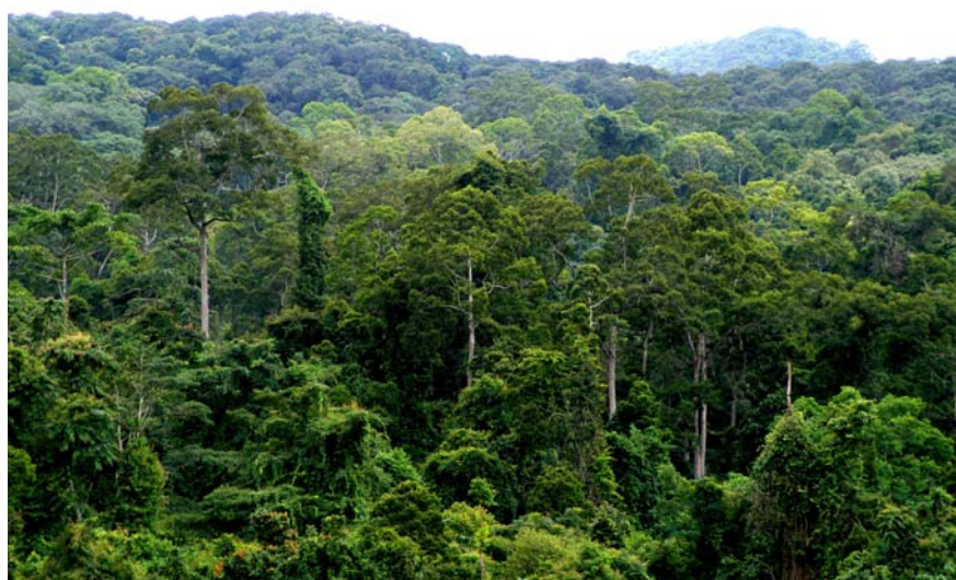
Fig. 2. The tropical seasonal rain forest in southern Yunnan, China

The long-tailed rank/abundance diagrams of the tropical seasonal rainforest indicate that the species with small population sizes make up an unusually large proportion of the total species composition [8, 16]. The frequency patterns also revealed that 40%-60% of tree species have only one individual, and 30%-40% of tree species two to five individuals. Fewer than 15% have 6-10 individuals and fewer than 10% have more than 10 individuals, from a 0.25 ha sampling plot [20].