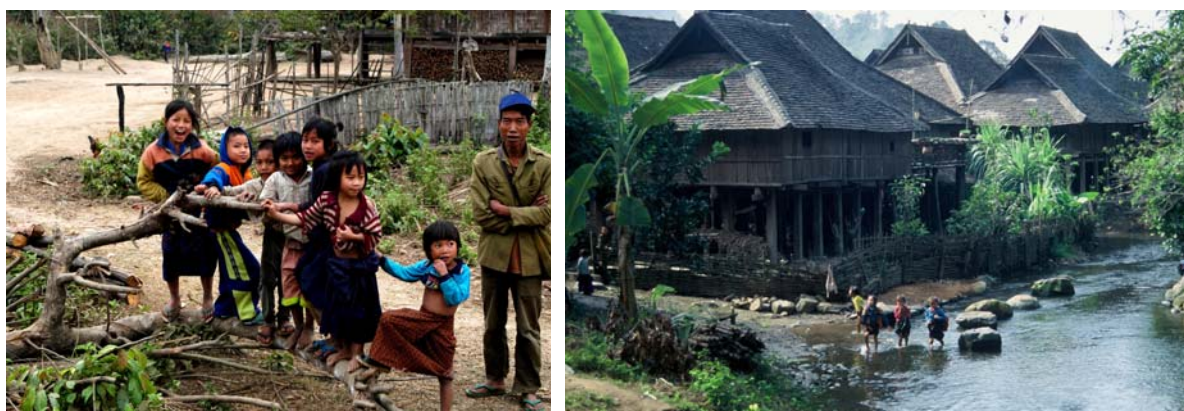
Fig. 3. Left: People of village of Yao. Right: Village and people of Dai. Southern Yunnan, China

A direct land connection between mainland SE Asia and Western Malesia existed until the early Pliocene (5 million years ago) and there was no geographical barrier to natural distribution of plants between mainland Southeast Asia and Western Malesia during most of the Tertiary [30]. The geological history of Southeast Asia could explain the Malaysian floristic affinity of the tropical seasonal rainforest in southern Yunnan.