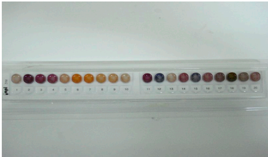
Figure 1. A picture showing the differential staining of the API-ZYM plate with ZYM A and ZYM B after 4 hours of incubation of larval homogenates with substrates dispersed on the porous plate. Each coloured well gives a rank score based on the intensity of colour formed.

approximate amount (in nmol) of the enzyme is given by comparison with a colour scale included in the kit, as compared with the control.