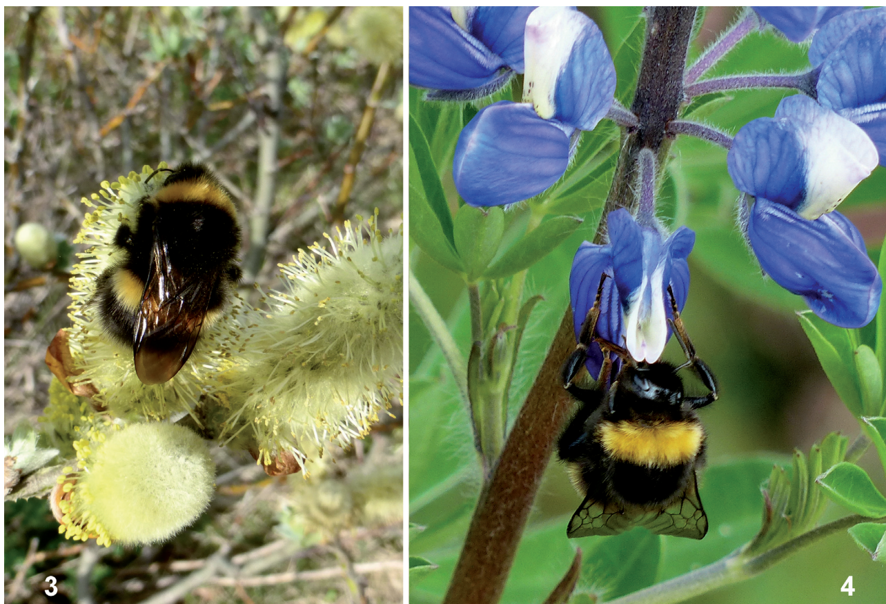
Figs. 3–4. Bombus lucorum queens visiting flowers in Iceland. – 3. Salix lanata (Bakkagerði, Höfn, 4.VI.2014). 4. Lupinus nootkatensis (Húsavík, Laxá, 8.VI.2014).

and snow. If we suppose that 177 grids are not ice- or permanently snow-covered, until today B. jonellus has been observed in 58 grids (33 %).