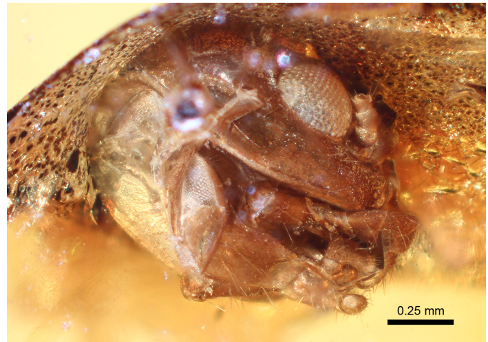
Figure E1. Photomicrograph of head of holotype of Termitotron vendeense n. gen. and sp.

Type species. — Termitotron vendeense , new species.