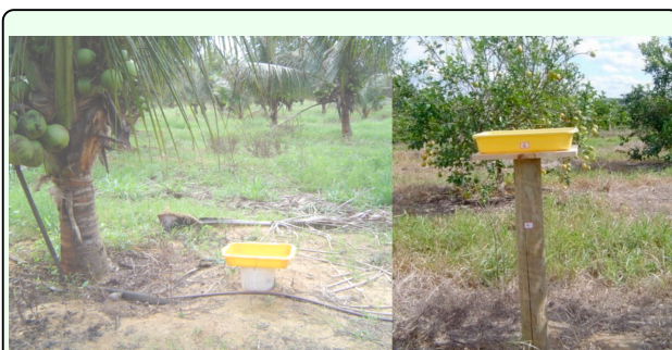
Figure 1. Yellow pan traps installed in the culture of Cocos nucifera on a plastic tube at a height of 0.2 meters above ground level (at left) and in the culture of Citrus spp. placed on wooden stakes at a height of 1.20 meters above ground level (at right). High quality figures are available online.

In each area cultivated with P. guajava , C. papaya , and Citrus spp., 10 traps were installed. These traps were placed on wooden stakes at a height of 1.2 m above ground level (Figure 1), spaced 25 meters from one another alternately in three rows. The collection and exchange of the trap solution was made weekly during 54 weeks, from June 2010 to July 2011.