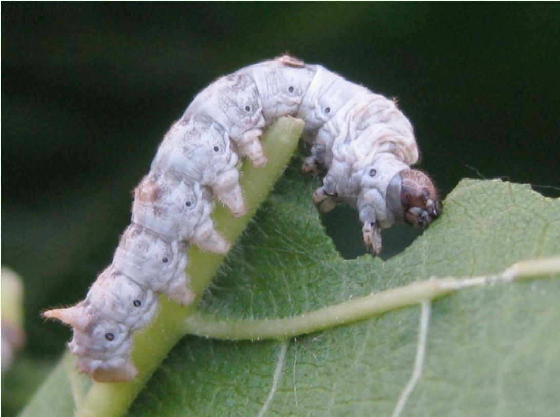
Figure 3. Fifth instar silkworm larva. High quality figures are available online.