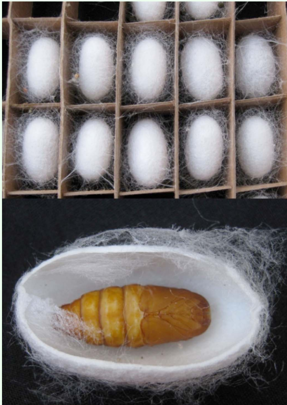
Figure 4. Silkworm cocoon and pupa. High quality figures are available online.