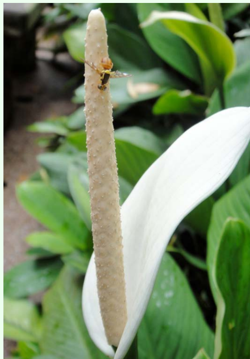
Figure 3. A male Bactrocera umbrosa feeding on Spathiphyllum cannaefolium spadix. High quality figures are available online.