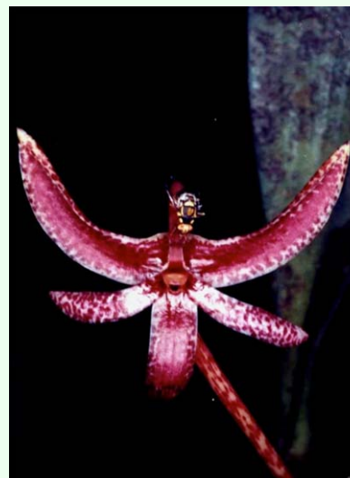
Figure 5. A male Bactrocera dorsalis bearing pollinia on see-saw lip of Bulbophyllum patens . High quality figures are available online.