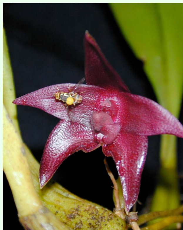
Figure 8. Flower of Bulbophyllum vinaceum with its spring-loaded lip in a closed position and a pollinarium-bearing fruit fly, Bactrocera dorsalis . High quality figures are available online.