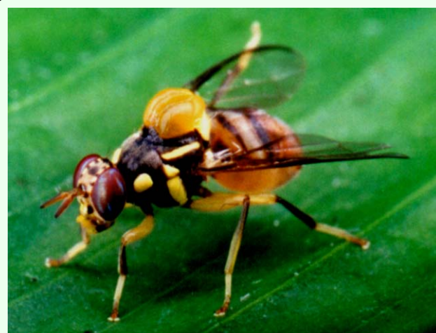
Figure 7. Male Bactrocera dorsalis bearing pollinia of Bulbophyllum cheiri . High quality figures are available online.