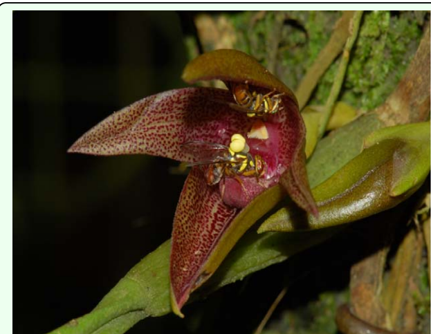
Figure 9. A male Bactrocera dorsalis bearing a pollinarium just removed from the Bulbophyllum elevatopuntatum flower (P.T. Ong). High quality figures are available online.