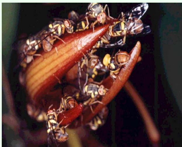
Figure 6. Male fruit flies, Bactrocera dorsalis , congregating and licking on a fully bloomed Bulbophyllum cheiri flower. High quality figures are available online.