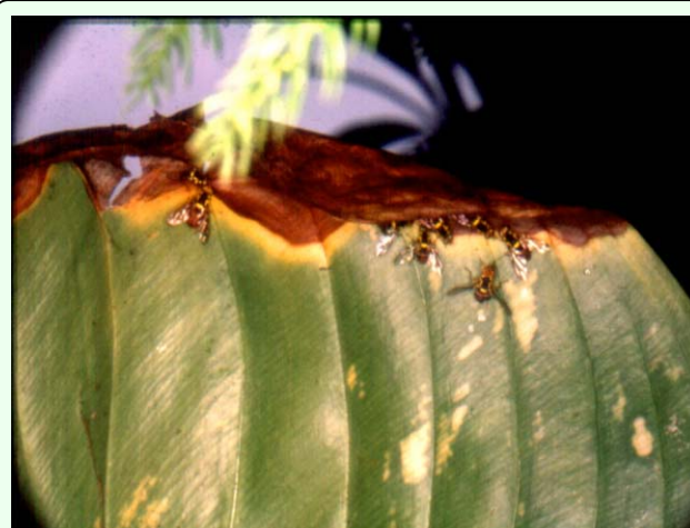
Figure 2. Male fruit flies ( Bactrocera dorsalis and Bactrocera umbrosa ) feeding along yellow-brown border of an infected leaf of Proiphys amboinensis . High quality figures are available online.