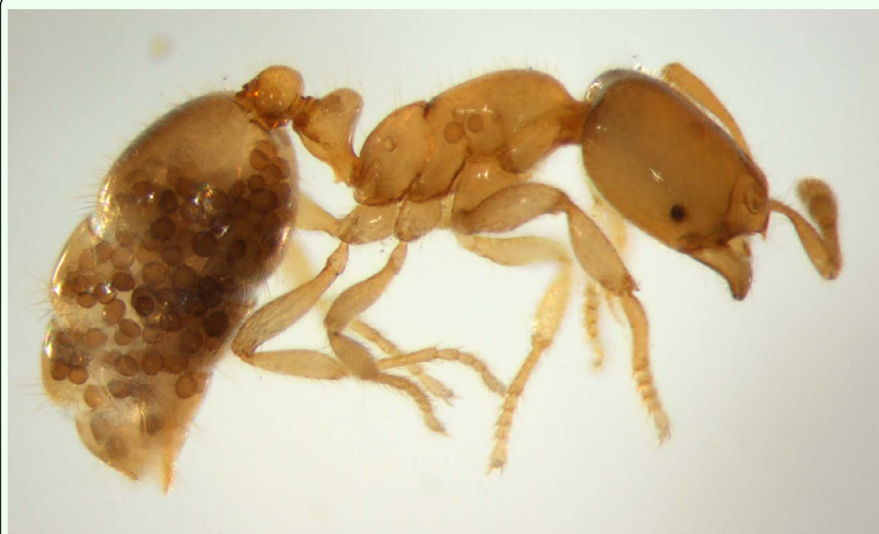
Figure 2. Mass of M. durum spores are visible in the gaster and the mesosoma of Solenopsis fugax worker collected in Czech Republic, near Mikulov at the end of August, 2010. High quality figures are available online.