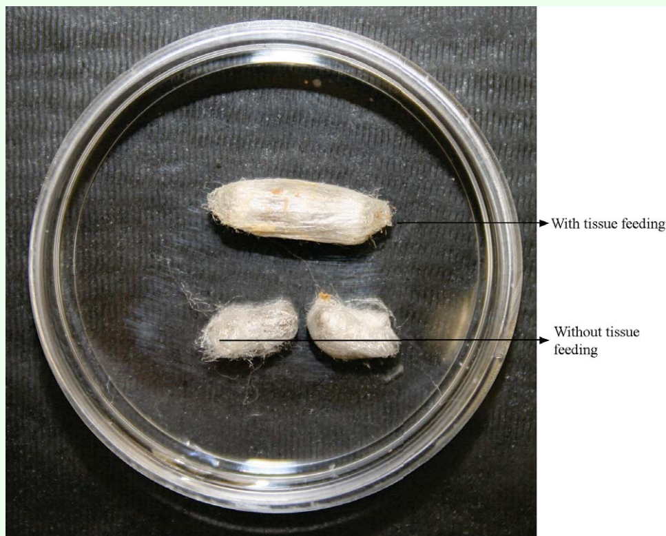
Figure 3. Comparison of the size of the cocoons from treatments with and without tissue feeding after egression. The cocoons formed from the larvae without post-egression tissue feeding were less than half the size of the cocoons formed from the larvae with post-egression tissue feeding. High quality figures are available online.

In the treatment with host tissue feeding, 80% of the adult wasps that developed were alive for more than 4 weeks as normally occurs under laboratory conditions. Only 20% of the emerged adults in treatment with restricted host tissue feeding survived for 1 week (Figure 4). There was a significant difference between these two treatments ( \chi^2 = 47.73 ; df = 1 ; and p < 0.0001 ).