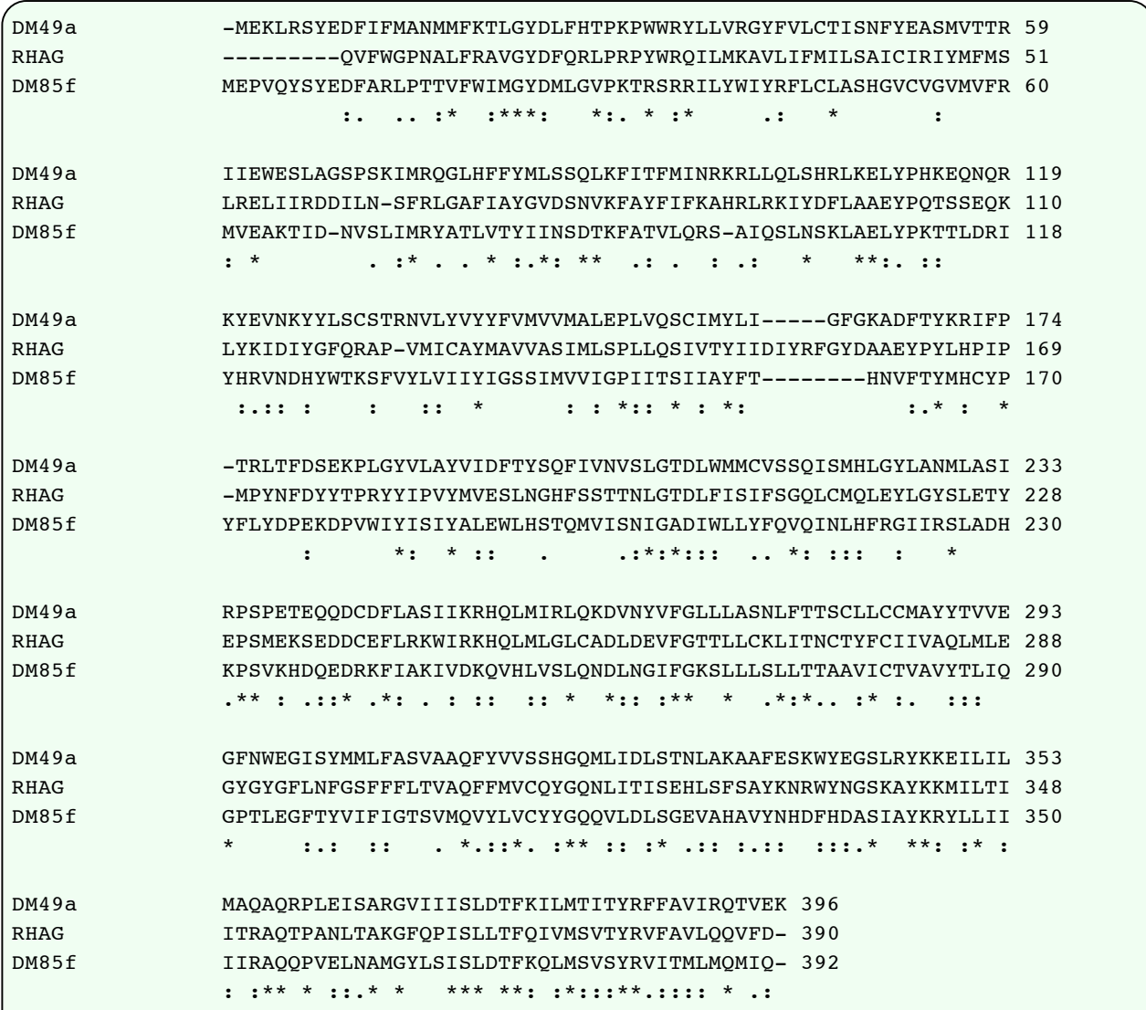
Figure 1. Clustal X alignment of the Rhagoletis suavis receptor RsOr1, and Drosophila melanogaster Or49a and 85f, which are the most similar sequences to RsOr1. Symbols: * = identical amino acids, : = conservative substitutions, . = semiconservative substitutions. High quality figures are available online.

The function of CSPs is not clear at this point. They are highly expressed in insect antennae, and some work supports a role as olfactory