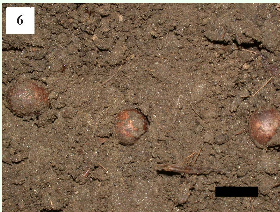
Figure 6. Reddish-brown spherical Scopelodes contracta cocoons in the soil. Scale bar: 10 mm. High quality figures are available online.

The presence of fallen leaves without basal parts and crawling larvae, together with the observations of individual larvae on leaves that were falling to the ground (Table 1) of four tree species and the high density of cocoons in the soil (Figure 6), indicate that mature S. contracta larvae parachute from tree crowns to the ground to spin their cocoons in the soil. Although the descent behavior has not been sufficiently observed for larvae, the larvae that were preyed on by ants under trees