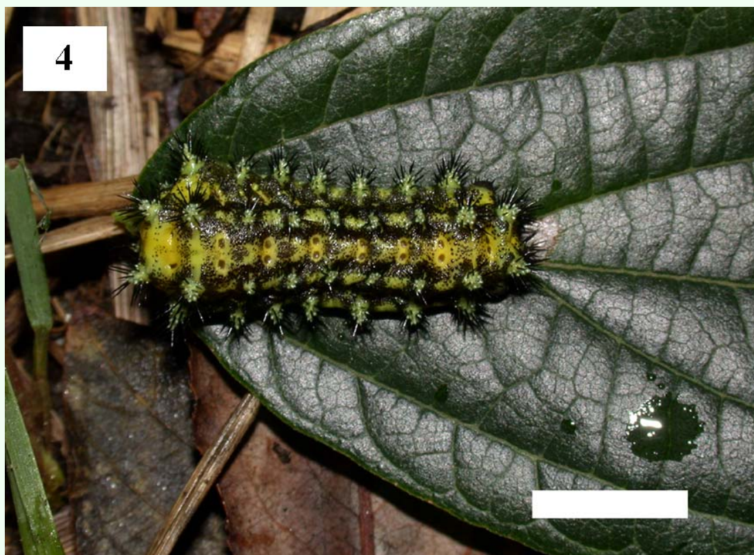
Figure 4. Scopelodes contracta larva on a Celtis sinensis leaf just after reaching the ground by parachuting. Scale bar: 10 mm. High quality figures are available online.