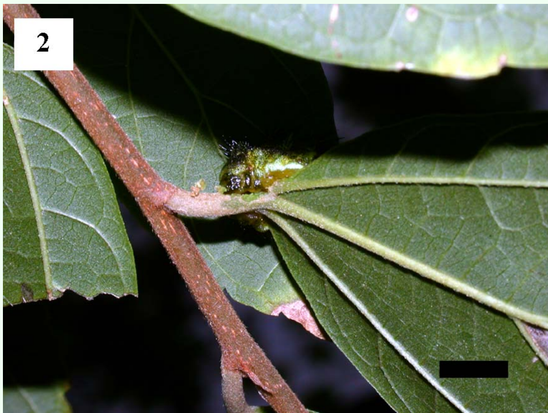
Figure 2. Scopelodes contracta larva feeding on the apical part of a petiole. The larva had just parachuted to the ground and was returned to a twig of the study tree. Scale bar: 10 mm. High quality figures are available online.