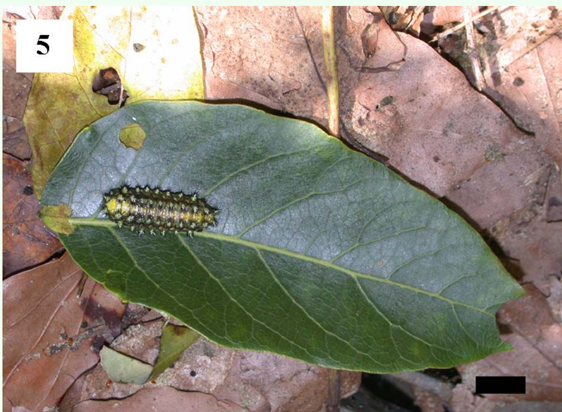
Figure 5. Scopelodes contracta larva on an Ailanthus altissima leaf just after reaching the ground by parachuting. Scale bar: 10 mm. High quality figures are available online.