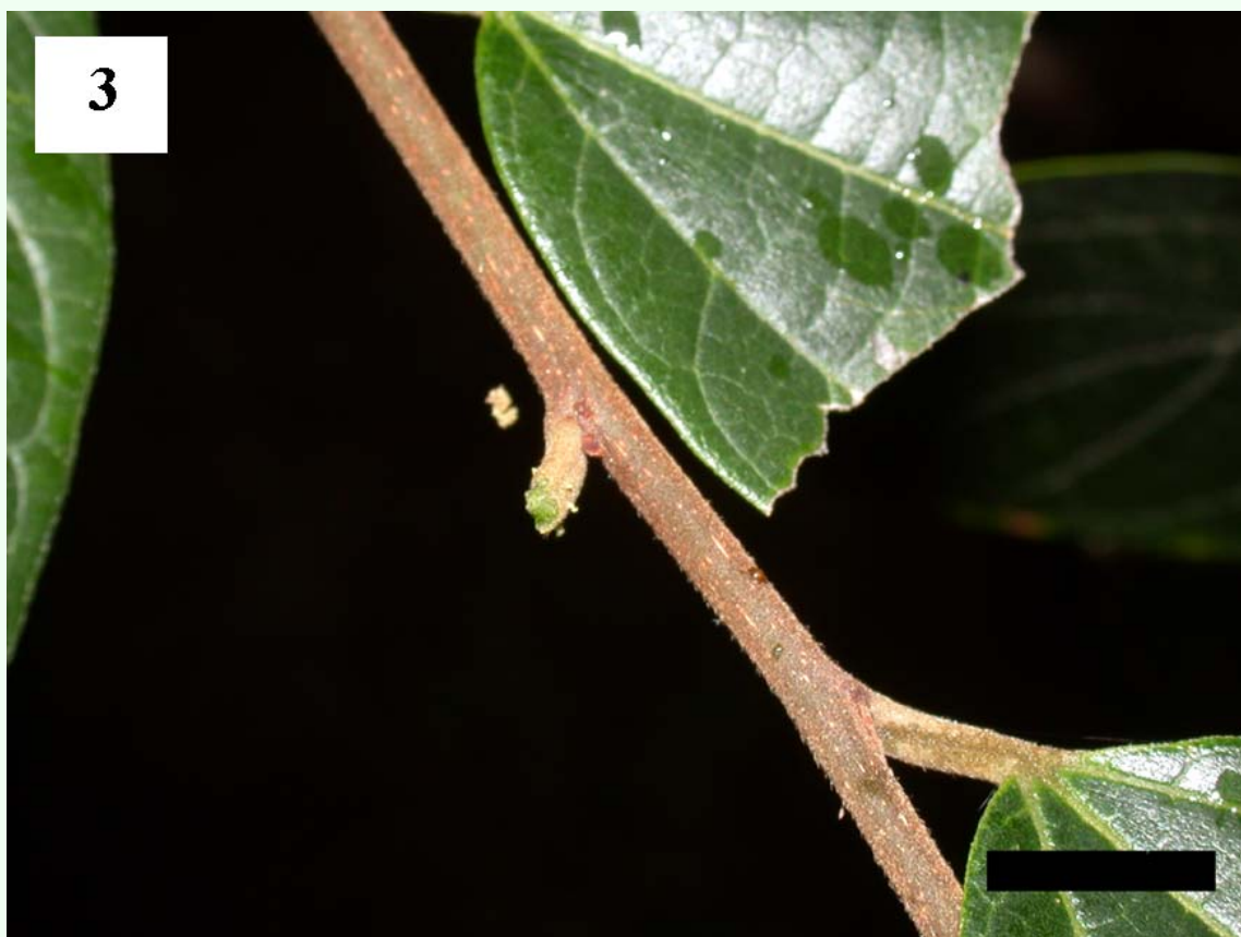
Figure 3. The petiole cut by the Scopelodes contracta larva. Scale bar: 10 mm. High quality figures are available online.