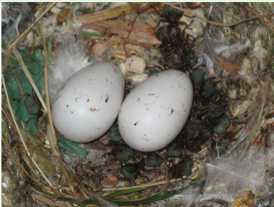
Figure 3. A nest particularly heavily parasitized by adult Crataerina pallida . There are approximately 20 adult C. pallida in this nest. High quality figures are available online.