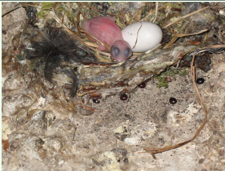
Figure 4. Pupae deposited to the side and beneath the nest. Two of the pupae are a dark brown in colouration, indicating that they have only recently been deposited. Pupae are typically black in colouration. Beneath the nest to the right is a small aggregation of adult Crataerina pallida that may be the result of mating competition. High quality figures are available online.

Other factors, such as the weather or climate, may also influence C. pallida numbers. A correlation between the abundances of a louse fly species on Serins, Serinus serinus , and the weather has been seen (Summers 1975). Recently fledged nestlings of the north island robin Petroica australis were more likely to be parasitized by C. pallida if they came from wetter territories (Berggren 2005).