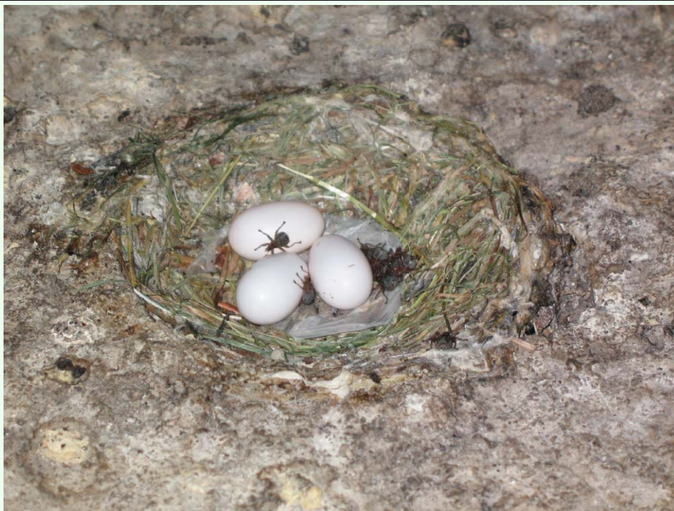
Figure 2. Adult Crataerina pallida at the nest during the incubation period of the Apus apus eggs. High quality figures are available online.

Adults emerged from 9 of the 20 pupae kept at room temperature between 27 April and 02 May, somewhat earlier than what would be expected. The group kept in the refrigerator hatched between August and October