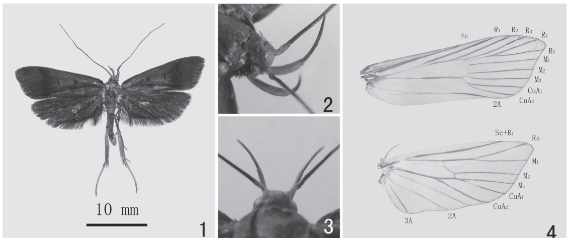
Figs. 1-4. Adult. 1. Adult of Synersaga atriptera sp. nov. ( \delta ); 2. Lateral view of head of S. atriptera sp. nov. ; 3. Dorsal view of head of S. atriptera sp. nov. ; 4. Venation of S. atriptera sp. nov.

Male genitalia (Fig. 5) Uncus listric. Gnathos rather slender, apex recurved like sharp hook.