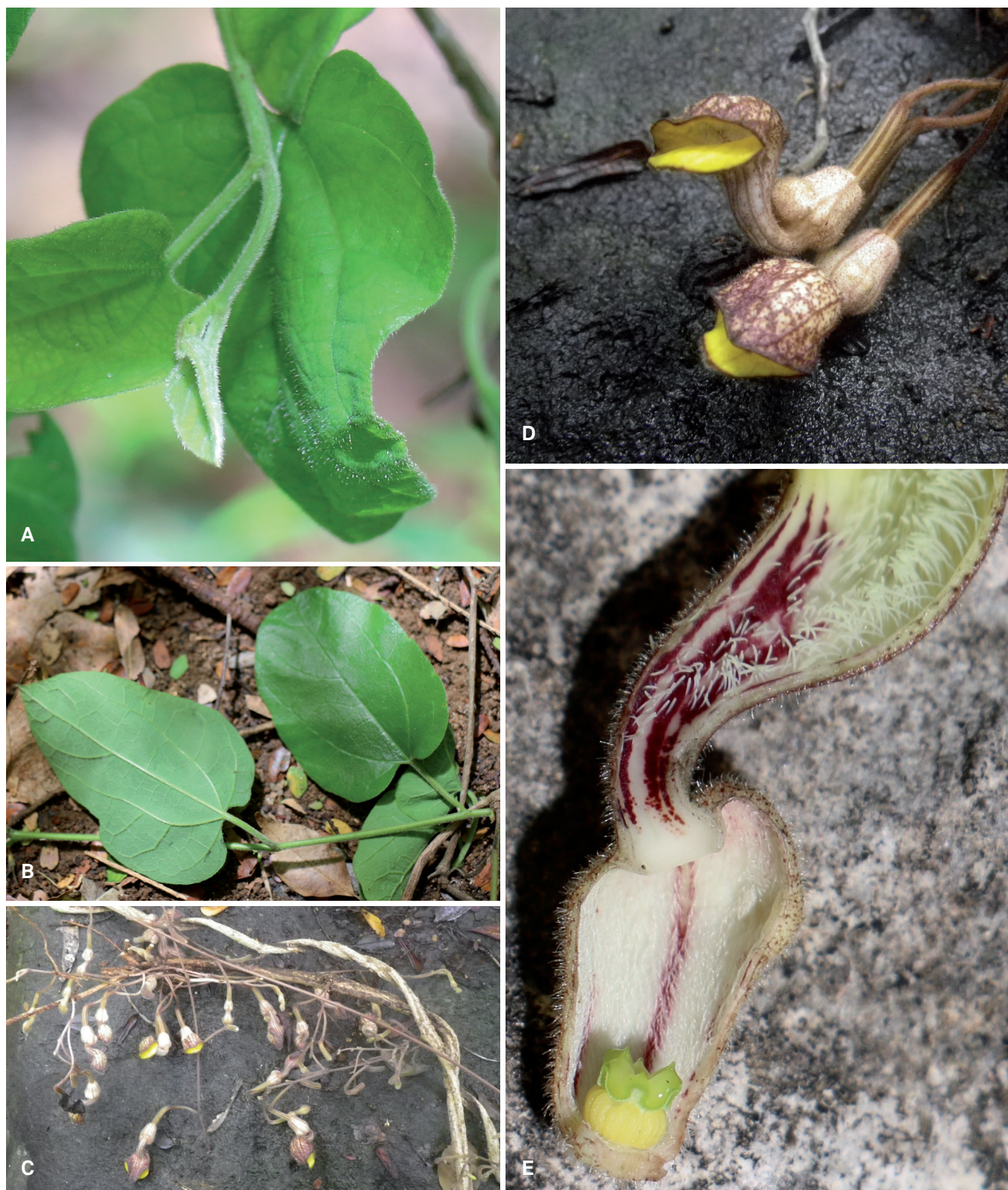
Fig. 2. – Pararistolochia enrcoi Luino, L. Gaut. & Callm. A. Young shoot; B. Variable forms of the leaves; C. Inflorescence; D. Flowers detail; E. Longitudinal section of the flower showing gynostemium, utricule, and throat.