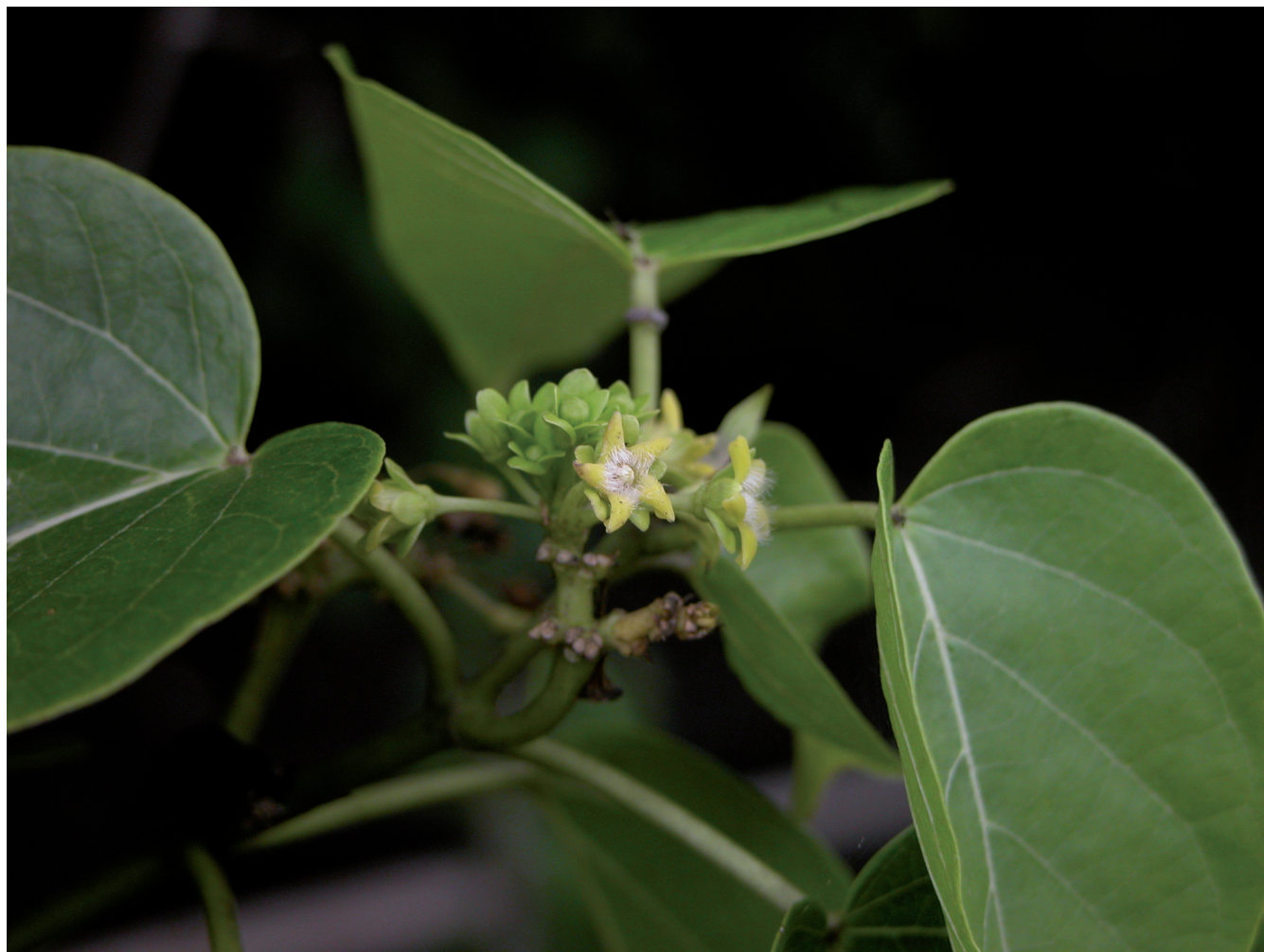
Fig. 2. – Field pictures of the new species Marsdenia mayottae W.D. Stevens, Labat & Barthelat.

style apex umbonate, 1.4-1.5 mm wide at base. Follicles narrowly ovoid with asymmetrical base, 7.5-9.5 × 2.5-3.5 cm, smooth, glabrous, follicle wall 5-7 mm thick; seeds elliptic, 8-11 × 5-7 mm, dark grey-brown with red-brown mottling, margin 0.6-0.7 mm wide, distally entire or inconspicuously crenulate, surface smooth, coma 3.5-4 cm long, white.