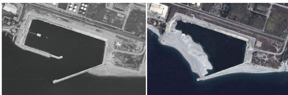
Figure 1. Aerial view of the Saline Joniche Port in 1984 and in 2013.

LST, set-up and wave run-up are the principal causes of coastal erosion and coastal flooding. The physical description and quantification of these phenomena are frequently carried out by means of simplified models. 3–8 Many times, all natural processes are influenced by urbanization which, through the construction of coastal structures, affects the natural evolution of the shoreline. 9 In these cases, it is important that a deep knowledge and investigation of the interaction between wave and structure is established in order to avoid the failure of an intervention. 10–14