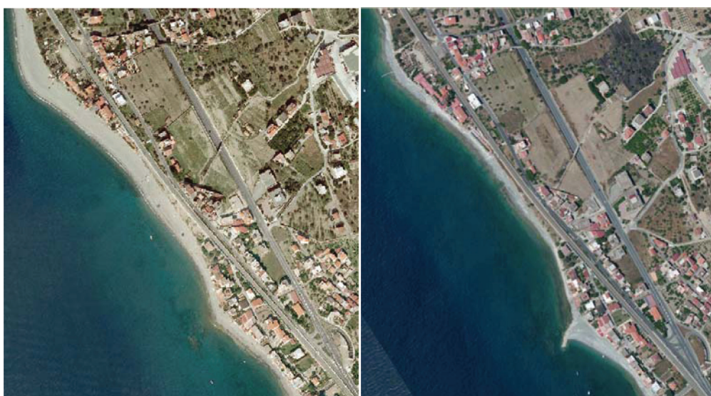
Figure 5. Aerial view of the groin in Lazzaro.