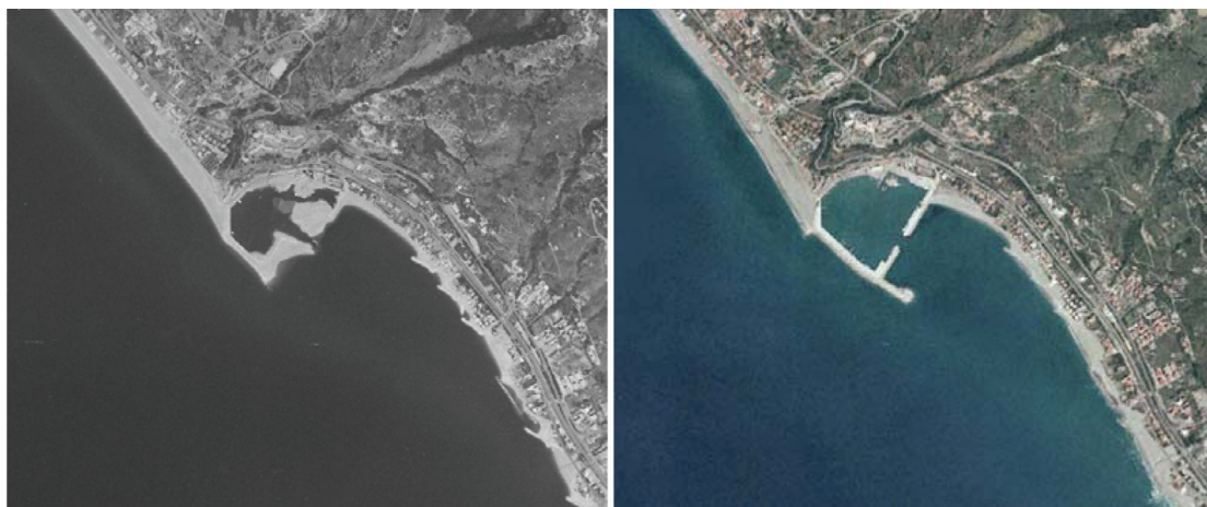
Figure 3. Aerial view of the Cetraro Port in 1988 before the dredging, and in 2000 after the dredging.