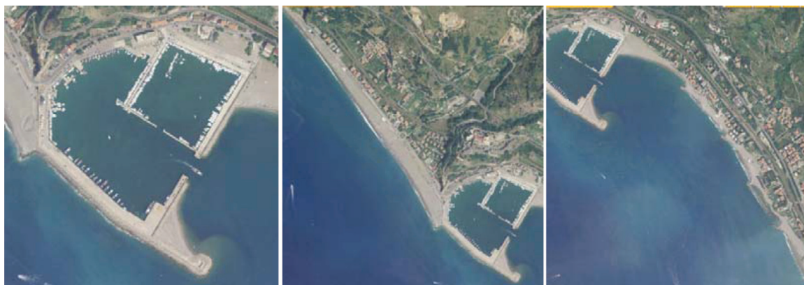
Figure 4. Aerial view of the actual situation of Cetraro Port, of the northwest side and of the southeast side.