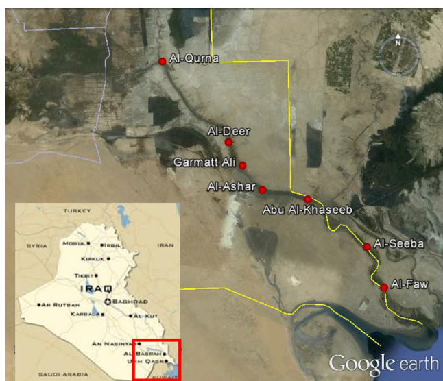
Figure 1. Sampling locations for air pollution in Basra city, southern Iraq.