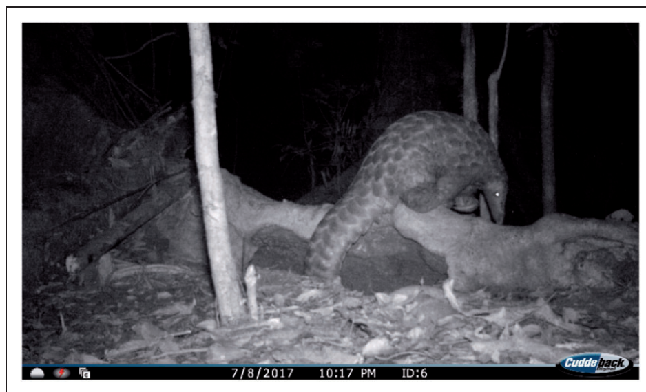
Figure 2. Giant pangolin photographed by camera trap leaving a burrow at Bouamir Research Station in the Dja Biosphere Reserve, Cameroon.

One camera trap out of nine at eight localities (two burrow entrances were associated with a single tree) photographed a pangolin at a burrow in this survey (Figure 2). The burrow was adjacent to a tree located on a northeast facing slope at the edge of a swamp. The tree had multiple burrow entrances around its trunk and roots, and cameras were placed to capture