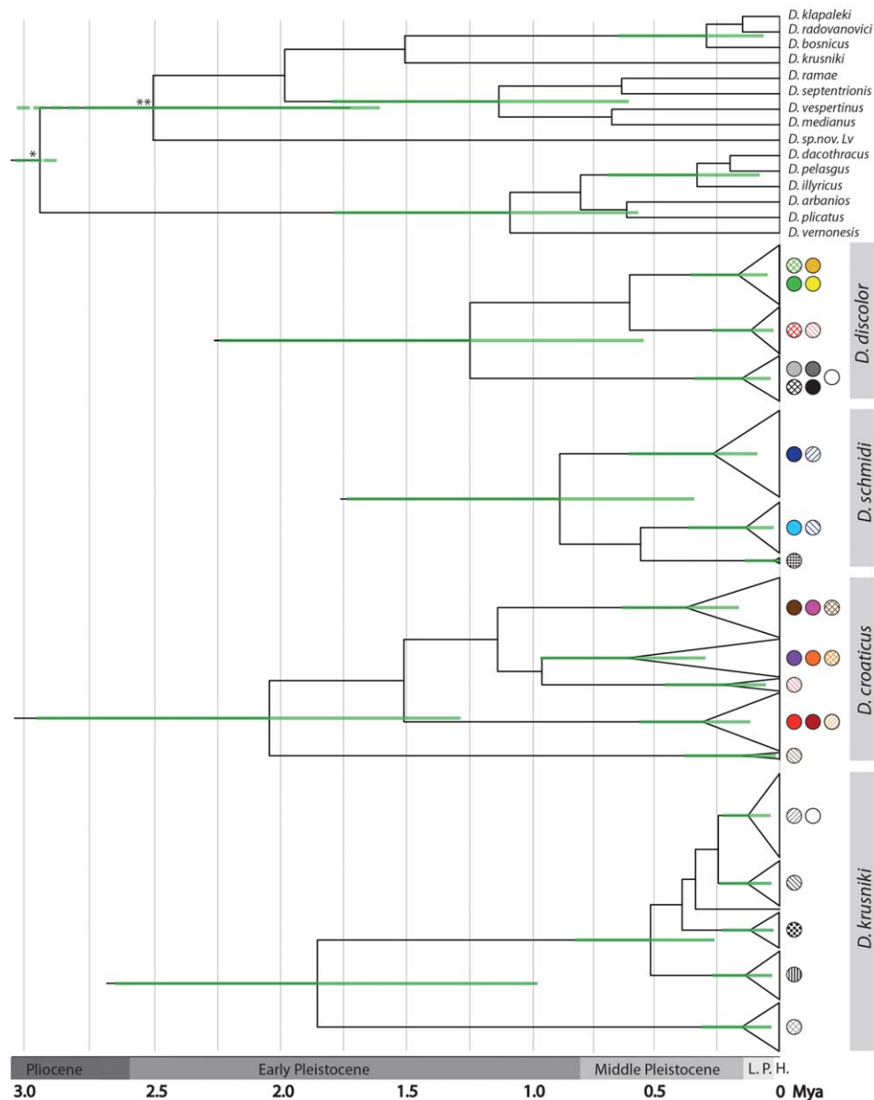
Figure 2. Estimates of divergence times for 15 endemic Western Balkan Drusus species of monophyletic origin and intraspecific divergence of the 4 target species based on BEAST analysis. Individual haplotypes were collapsed by clades. Clades are coded according to their geographic origin (see Fig. 1). Green bars indicate 95% highest posterior density (HPD) intervals for divergence times of individual nodes (Node *: mean age estimate = 5.288 Mya and 95% highest posterior density [HPD] interval = 7.77–3.31 Mya; Node **: 95% HPD interval = 3.72–1.61 Mya). Vertical grey lines show 250 ky increments. Epoch boundaries are shown according to Litt et al. 2008 (L.P. = late Pleistocene, and H. = Holocene).

of the karstification process in the region (Sket 1999, Mihevc et al. 2010). Some of our estimates of divergence times differ from previous estimates of divergence of Drusus endemics in the Dinaric region of the Western Balkans. Previous dates were estimated from a more limited data set and with different models applied for divergence estimation (Previšić et al. 2009). Both factors can affect divergence time estimates (Drummond et al. 2006). However, results of previous studies and our results support regional speciation and differentiation beginning in the late