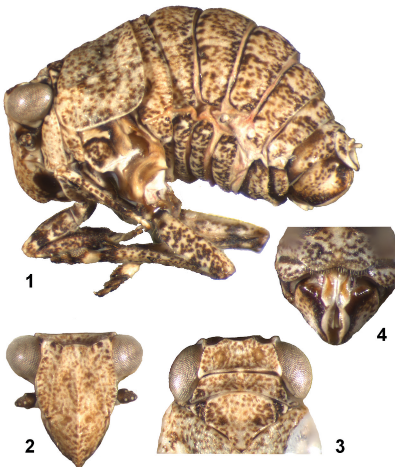
Figs 1–4. Campures pallens gen. et sp. n., holotype: (1) lateral view; (2) frontal view; (3) head and pro- and mesonotum, dorsal view; (4) ovipositor and VII sternum, ventral view. Total length of the specimen: 3.2 mm.

Coloration: General coloration light-brown yellowish with dark-brown spots and dots (Figs 1–4). Genae with dark-brown spot above the scapus. Pedicel dark brown with light-yellow sensory organs. Postclypeus with large oval dark-brown spot on each side. Apex