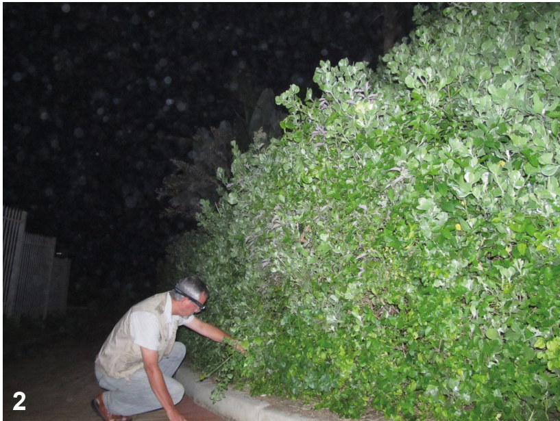
Figs 1, 2. Photographs at night of senior author D.S. Glazier near rows of bietou bushes Chrysanthemoides monilifera rotundata along walkways near The Promenade of Umhlanga beach, South Africa. These are two of the sites where numerous individuals of the isopod Tylos capensis were observed climbing on bietou bushes.

edges), whereas those from Yzerfontein were thicker (more succulent) and more smoothly rounded, thus more closely matching those of the subspecies C. monilifera rotundata observed at our field site in Umhlanga (cf. Weiss et al. 2008). However, the