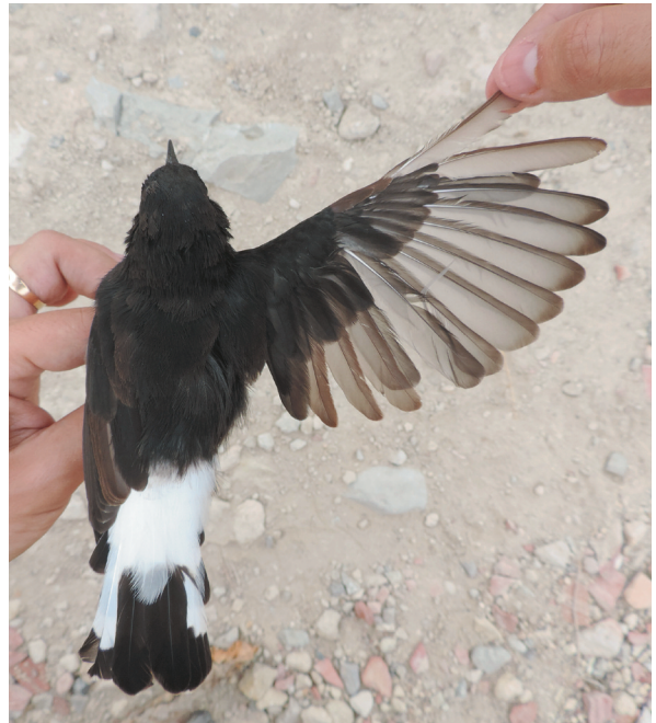
Pattern of the post-breeding moult of a first-year male Black Wheatear. This bird had completed moult of P1–P6 and S1, and P7 and S2 were growing, S3 was starting to grow and P8–10 and S4–S6 were not moulted (photo CPG, 11 September 2017, Alicante, Spain).

Black Wheatears were caught using small spring-traps baited with Morio Worms Zophobas morio and with the aid of a playback within their territories during the first two hours after sunrise. Birds were ringed to avoid pseudoreplication, weighed with a precision scale (accuracy 0.1 g) and their tarsus length was measured with digital callipers (accuracy 0.01 mm) in order to estimate body condition index (see below). All individuals were sexed and aged as immatures (birds that had not yet undergone a complete moult) or adults (birds