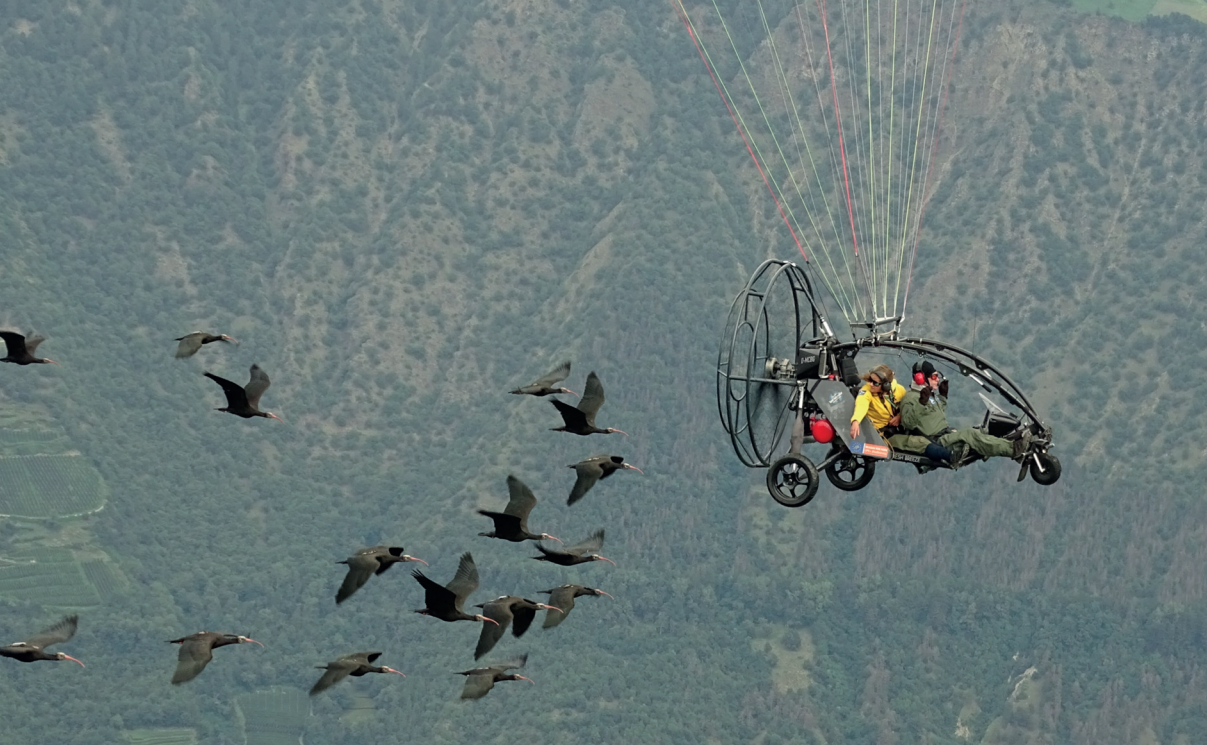
Figure 1. Formation flying by an ultralight and Northern Bald Ibises. The foster-mothers in yellow give encouragement and instruction to the hand-raised birds they know so well, and with which they spend much of the on-the-ground time too (top photo Helena Wehner, bottom photo Anne-Gabriela Schmalstieg).