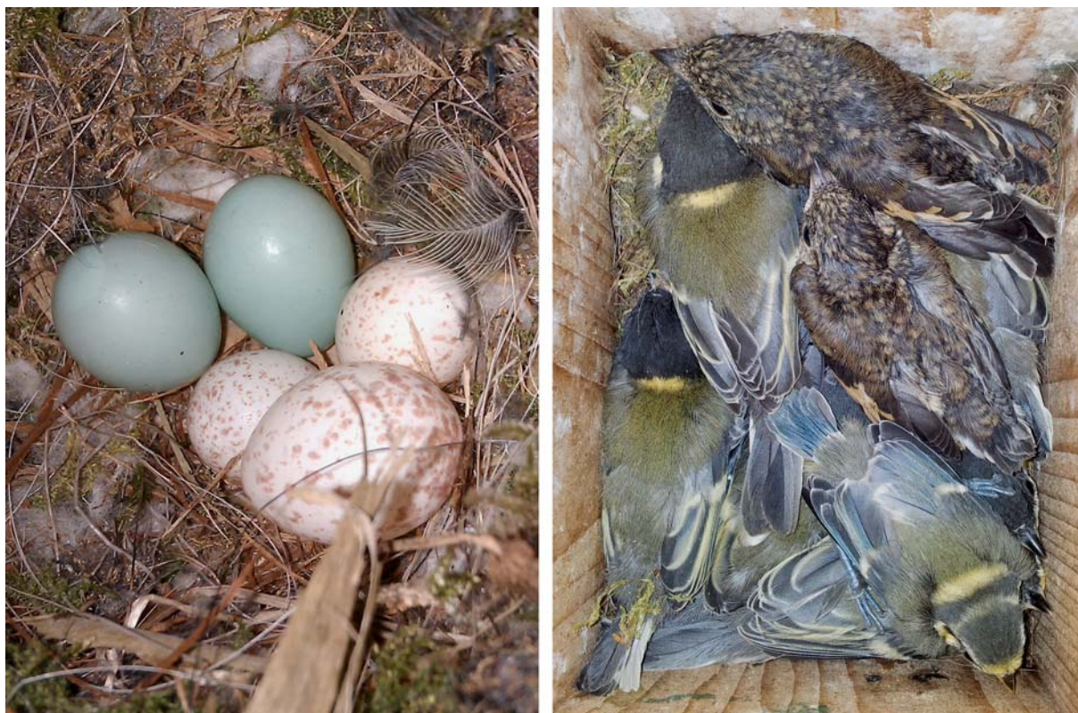
Figure 2. Left panel: two Pied Flycatcher eggs (left), two Blue Tit eggs (middle) and a Great Tit egg (right) after the second takeover. Right panel: a Blue Tit, two Pied Flycatcher and six Great Tit chicks three days before fledging.