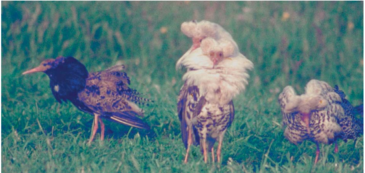
Figure 1. Two territorial independent males (left and right) and two satellite males (middle) on a lek.

Warburg 1966, van Rhijn 1991, 2013, Jukema & Piersma 2006): independent males, satellite males and faeders (female mimics). These male types and strategies become apparent on leks where males display and females select a mating partner. It has been shown that each male follows only one of these strategies during its whole life and that the different reproductive strategies in Ruffs are based on different combinations of genes (Lank et al. 1995, 2013, Farrell et al. 2013). Independent males try to defend a territory on the lek and have mostly dark coloured nuptial plumage. Satellite males do not establish their own territory but instead, to gain access to females, temporarily associate with one of the independent males. Satellites have mostly white nuptial plumage (Figure 1). However, plumage coloration sometimes fails to predict reproductive strategy, as some types of plumages may occur both among independent and satellite males (Hogan-Warburg 1966, van Rhijn 1991). Faeders do not develop conspicuous ornamentation and look like females.