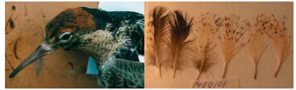
Figure 7. Head and feather sample of male 149101, apparently with two different hues in its nuptial plumage.

For birds in complete nuptial plumage, we rarely scored more than one distinct hue (ruff and head tufts together, see Table 3). In the central part of the table, within the inner rectangle, the values in cells are zero or very low,