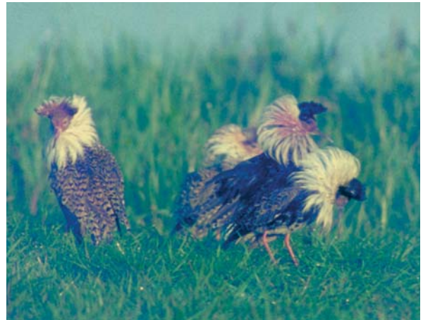
Figure 8. Reproductive strategy is not fully associated with white plumages. The two males at the right side are both independent males. Their ruffs are (almost) white and their head tufts black. The male at the left side of the picture is a satellite male with a white ruff and light brown head tufts. The male on the background is probably a satellite male.

The fourth, patterning of feathers, has been simulated with reaction-diffusion models (Prum & Williamson 2002). These simulations suggest that the number of (molecular) instructions is not necessarily high for creating a complicated colour pattern in a