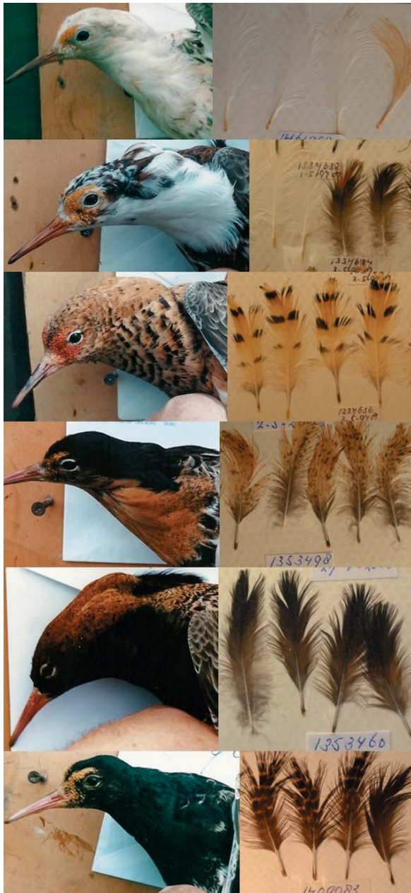
Figure 6. Portraits and feather samples of six males, typical representatives of the general plumage categories: 1461959 (white–white), 1337634 (white–hue), 1337636 (hue–hue), 1353498 (hue–black), 1353460 (black–hue) and 1409083 (black–black).