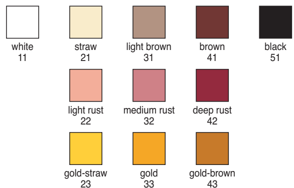
Figure 2. Colour classification for nuptial feathers. Scheme and drawings developed by D.B. Lank and C.M. Smith.

Most analyses were performed by JvR. The first analysis, on all 1814 individuals caught at stopover sites ( Primary Dataset ), generated questions on both general and more detailed characteristics that had not yet been scored. To work this out, photos and feather samples of a subset of 781 males (the best accessible records) were carefully viewed, interpretations in the