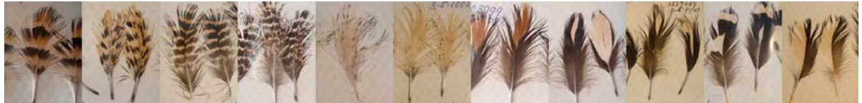
Figure 5. Samples of different patterns of feathers. From left to right: wide bars, broken bars, two variants of fine bars, black threads, black spots, four different variants of fairly large patches at the tip, and black and hue separated by the shaft.