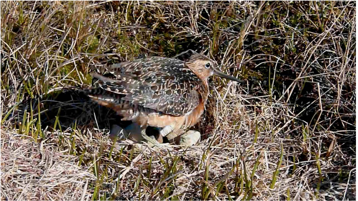
Figure 2. Still shot from video footage of the Long-billed Dowitcher flushing from the nest; video taken on 22 June 2011.

typical of shorebirds incubating a nest (Simmons 1952). The following day between 15:00 and 15:30 h we videotaped the bird with a digital camera from a minimum distance of 3 m as it incubated the nest and flushed when we approached (Figure 2). The bird flew only a few meters away from the nest and returned to it immediately once we moved away; seven minutes later we recorded a second video of the incubating bird.