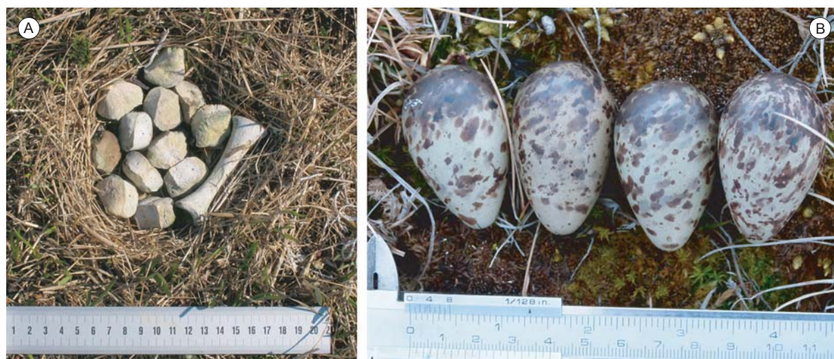
Figure 1. (A) The Long-billed Dowitcher 'clutch' of twelve intervertebral discs and one elongated bone of an unidentified mammal; photo taken on 26 June 2011. (B) Normal clutch from a Long-billed Dowitcher nest at the study site.

Upon our approach, the dowitcher flushed from the nest and displayed rodent run distraction behaviour