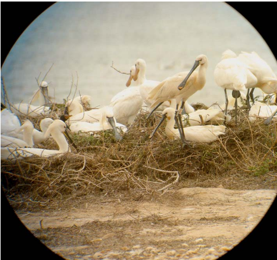
Figure 3. A colour-ringed bird born on Terschelling in 1997 standing on its nest on Nair (Banc d'Arguin) on 17 May 2010. A month later it was observed feeding chicks. Its partner (sitting on the nest) has a yellow bill tip. Given that male spoonbills generally have larger bills than females, the standing bird is probably a male.

studies on avian subspecies. A sample of studies on migrant bird species, although generally using slightly smaller sets of microsatellite loci, showed rather comparable levels of differentiation; in order of increasing F_{ST} : Dunlin Calidris alpina (three subspecies, 7 loci, F_{ST} \leq 0.010 ; Marthinsen et al. 2007), Canada Goose Branta canadensis (two subspecies, 6 loci, F_{ST} = 0.021 ; Mylecraine et al. 2008), Bluethroat Luscinia svecica (seven subspecies, 7–11 loci, F_{ST} = 0.042 ; Johnsen et al. 2006), Reed Bunting Emberiza schoeniclus (two subspecies, 6 loci, F_{ST} = 0.043 ; Kvist et al. 2011), and Piping Plover Charadrius melodus (two subspecies, 8 loci, F_{ST} = 0.104 ; Miller et al. 2010). Thus, with F_{ST} = 0.063 , the observed genetic differentiation between the two Spoonbill subspecies seems to fall in the upper range of values. On the basis of this comparison the subspecies status of balsaci seems entirely valid.