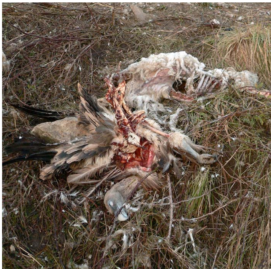
Figure 1. Leftovers of the carcasses of a Griffon Vulture and a sheep eaten by vultures. The rock on the left trapped the vulture's wing.

cate if the birds had been killed by conspecifics or not. Margalida et al. (2004) recorded cannibalism in a Bearded Vulture Gypaetus barbatus nest. Kornan & Nacek (2011) recorded parental infanticide followed by cannibalism in Golden Eagles Aquila chrysaetos . Cannibalism linked with natural deaths of nestlings has also been documented in other raptor species, among others American Kestrel Falco sparverius (Bortolotti et al. 1991), Booted Eagle Aquila pennata (Dios 2003) and Bald Eagle Haliaeetus leucocephalus (Markham & Watts 2007).