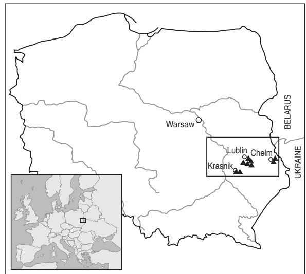
Figure 1. Location of Little Owl study sites in the Lublin Region, eastern Poland.

Locations of radio-marked owls were made between 27 April and 3 August, i.e. from egg laying until the young dispersed, during 2000 to 2003. Observers tracked owls on foot, and observation periods on each owl typically started before nightfall at 19:00–20:00 and lasted until 4:00–5:00. Owl locations were plotted on 1:10 000 scale maps using the triangulation