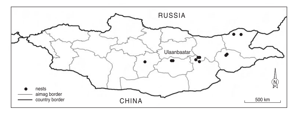
Figure 1. Locations of 11 Eagle Owl nests studied in Mongolia, 2004–06.

Adiya (2000), Bannikov (1954), Dulamtseren (1987), Enkhbold (unpubl. data) and Sokolov & Orlov (1980). Unidentified prey remains were excluded from biomass estimates. We used descriptive analyses (for height of substrates, sizes of clutch and pellet, weight of prey species) and correlation analyses (on height of substrate and number of eggs and chicks; frequency and weight of prey species of birds and mammals) for statistical analysis as developed by Krebs (1989) and Jump 5.0 Statistical Discovery from SAS Software, USA and Microsoft Excel. Means \pm SD are given.